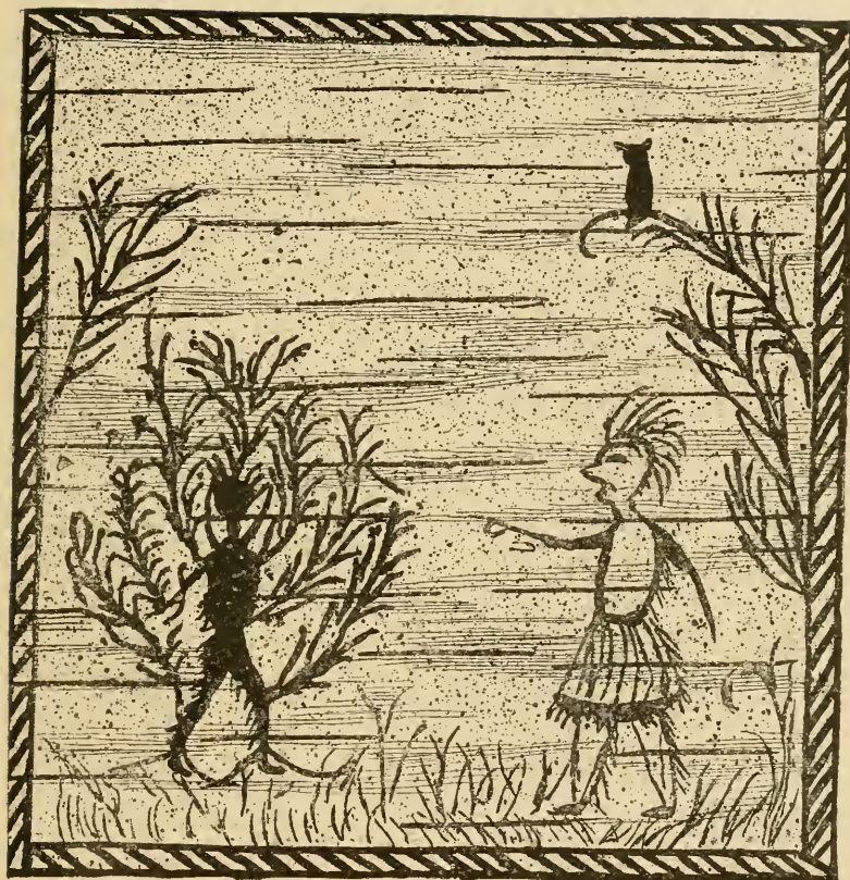
GLOOSKAP TURNING A MAN INTO A CEDAR-TREE.