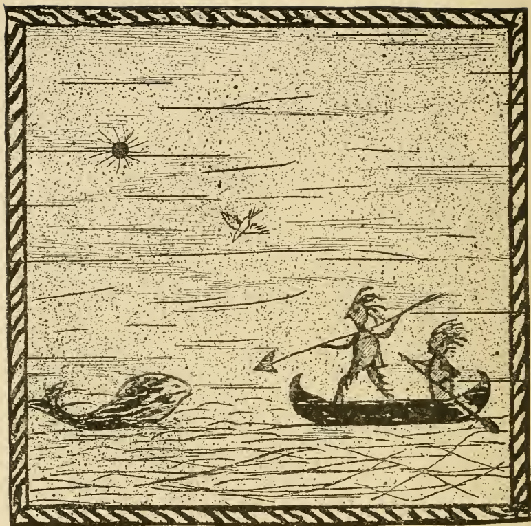
GLOOSKAP AND KEANKE SPEARING THE WHALE.