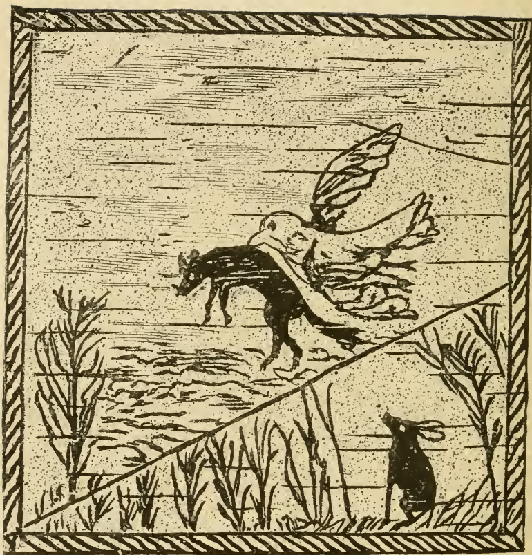
LOX CARRIED OFF BY CULLOO.