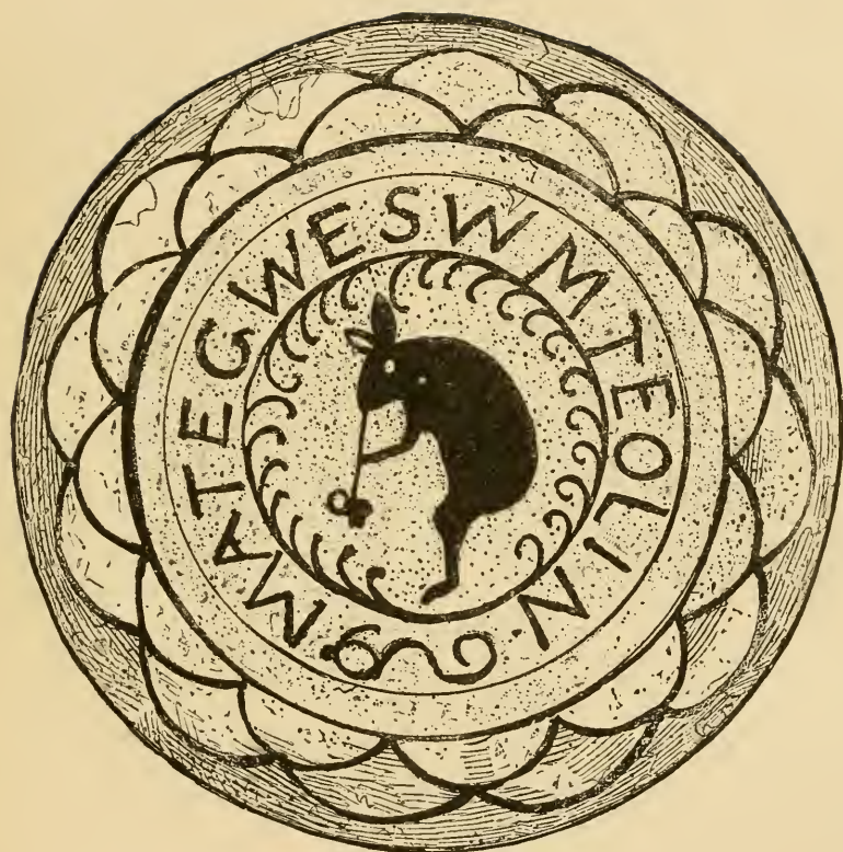
THE RABBIT MAGICIAN.