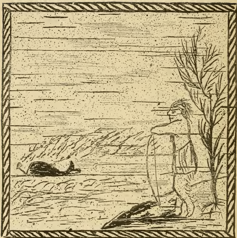
GLOOSKAP LOOKING AT THE WHALE SMOKING HIS PIPE.