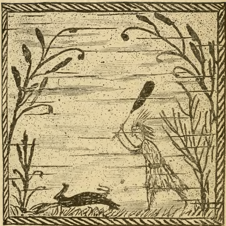
GLOOSKAP KILLING HIS BROTHER, THE WOLF.