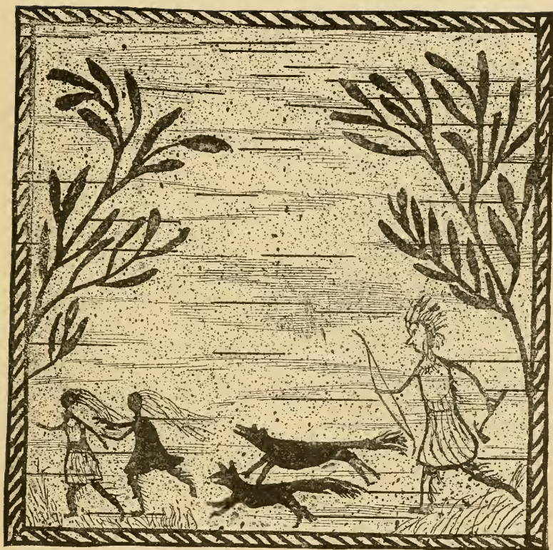
GLOOSKAP SETTING HIS DOGS ON THE WITCHES.