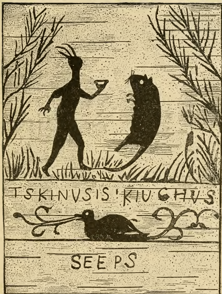
THE INDIAN BOY AND THE MUSK-RAT. SEEPS, THE DUCK.