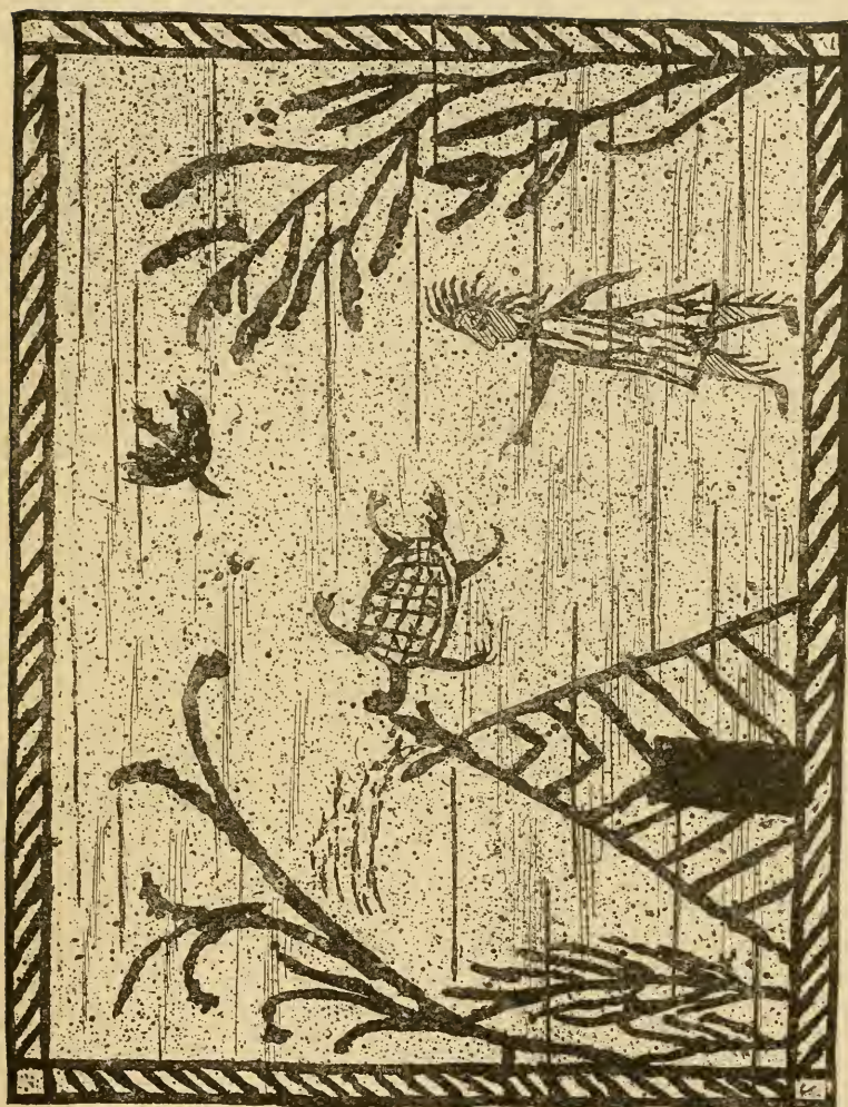
THE MUD-TURTLE JUMPING OVER THE WIGWAM OF HIS FATHER-IN-LAW.