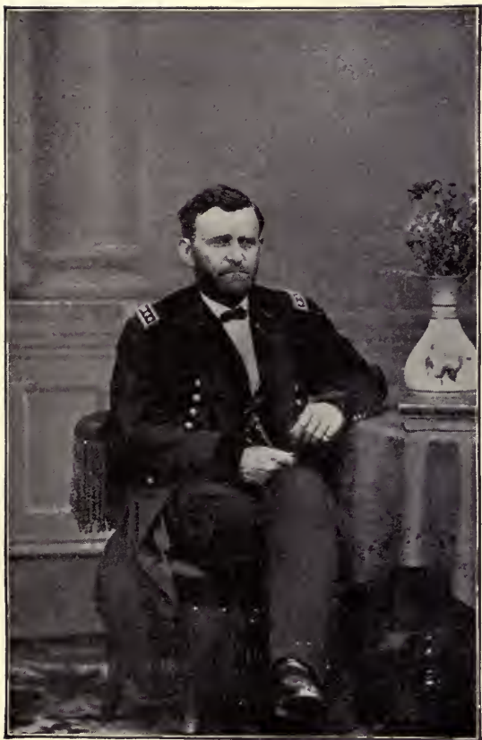
GENERAL ULYSSES S. GRANT.