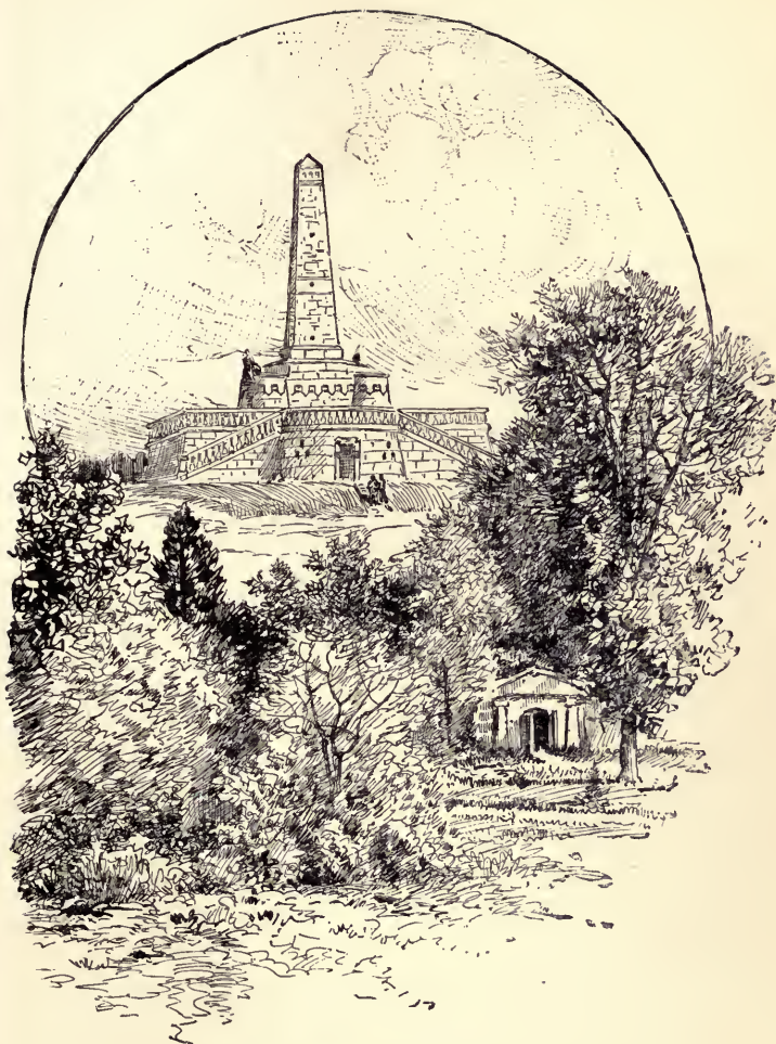
THE LINCOLN MONUMENT, SPRINGFIELD, ILL.