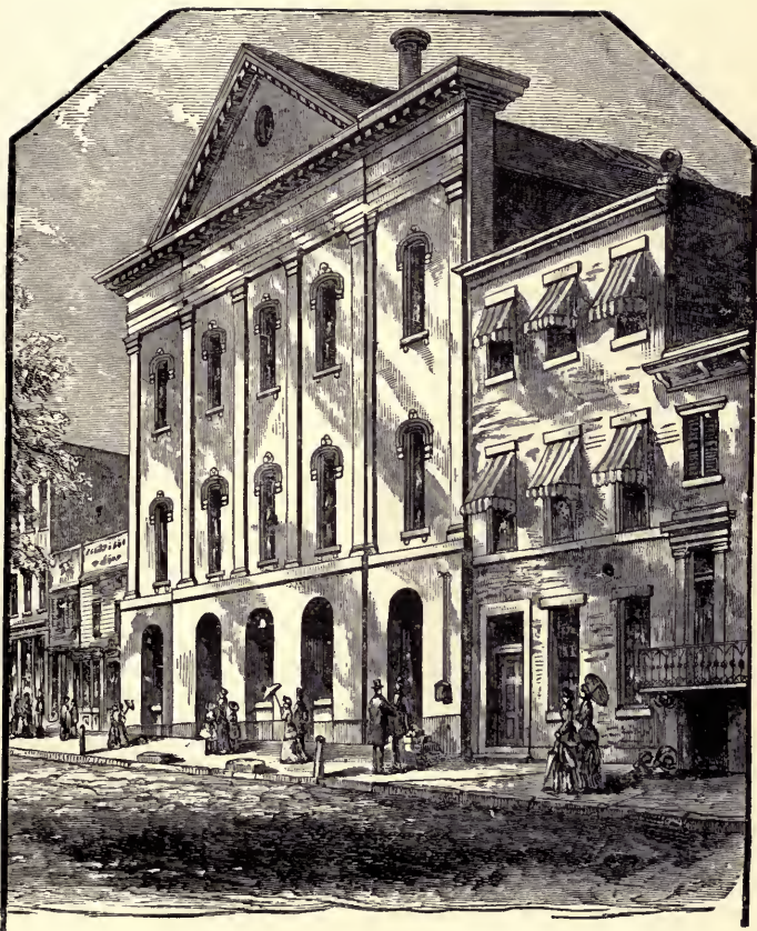
FORD'S THEATRE, WHERE PRESIDENT LINCOLN WAS ASSASSINATED.