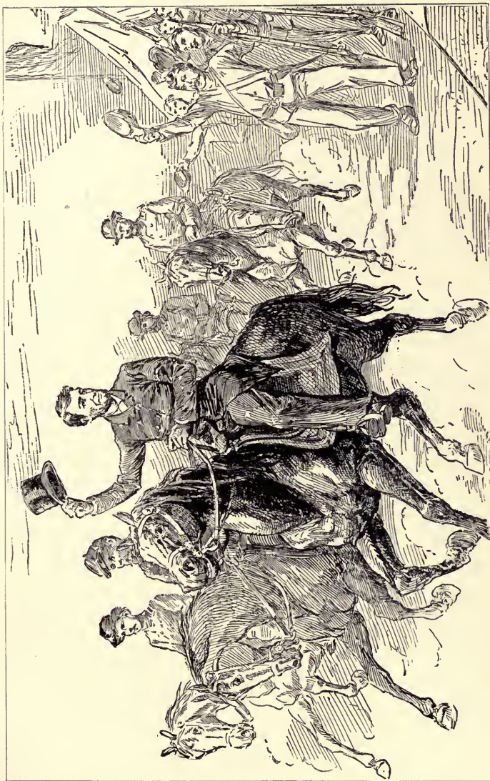
LINCOLN VISITING THE ARMY.