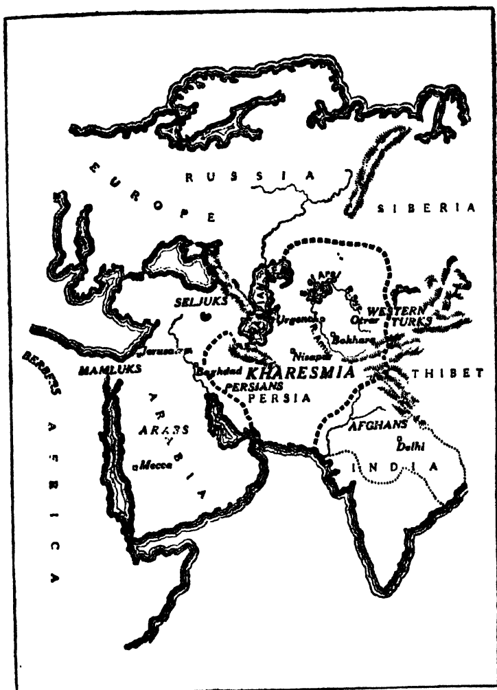
THE KHARESMIAN EMPIRE AT THE BEGINNING OF THE THIRTEENTH CENTURY, SHOWING THE POSITION OF THE OTHER MOHAMMEDAN POWERS.