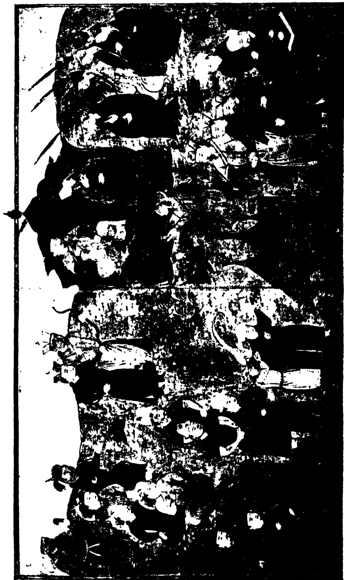
GHAZAN, THE IL-KHAN OF PERSIA, SEVERAL GENERATIONS AFTER GENGHIS KHAN.