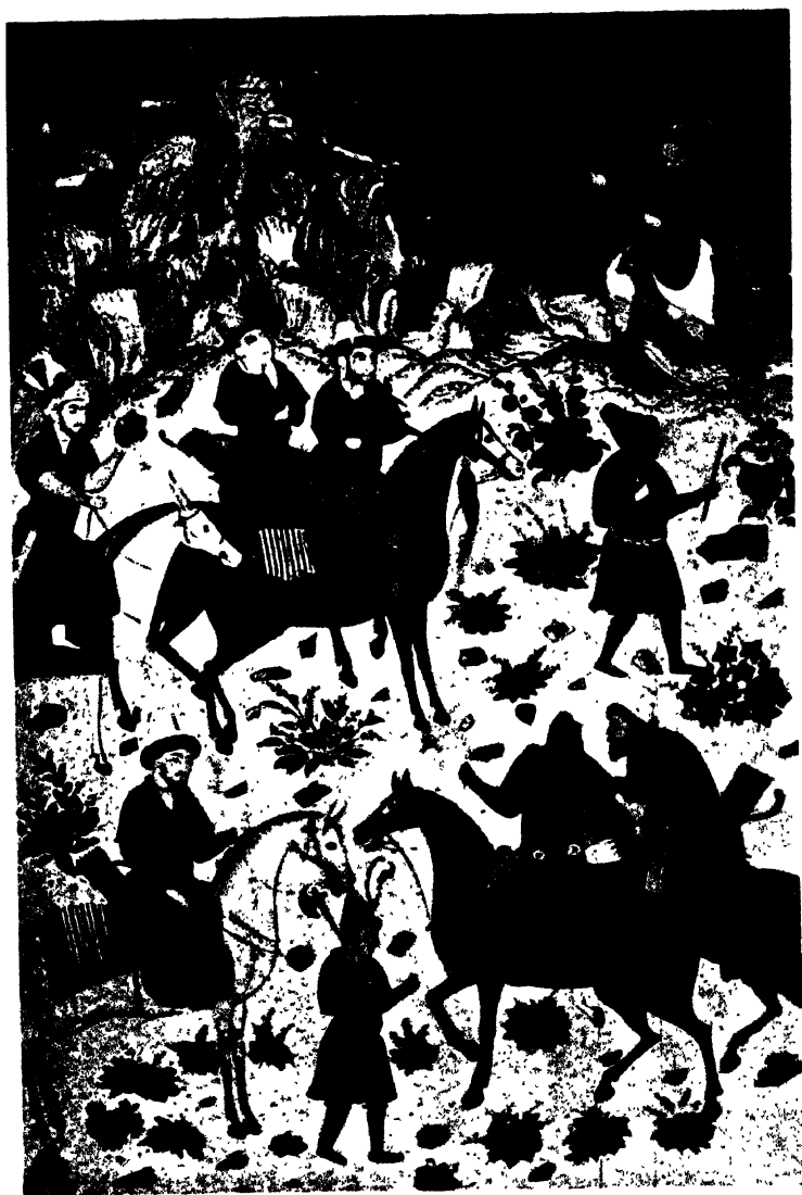
A PERSIAN HUNTING SCENE, EARLY SEVENTEENTH CENTURY.

This shows the types of weapons used for the chase.