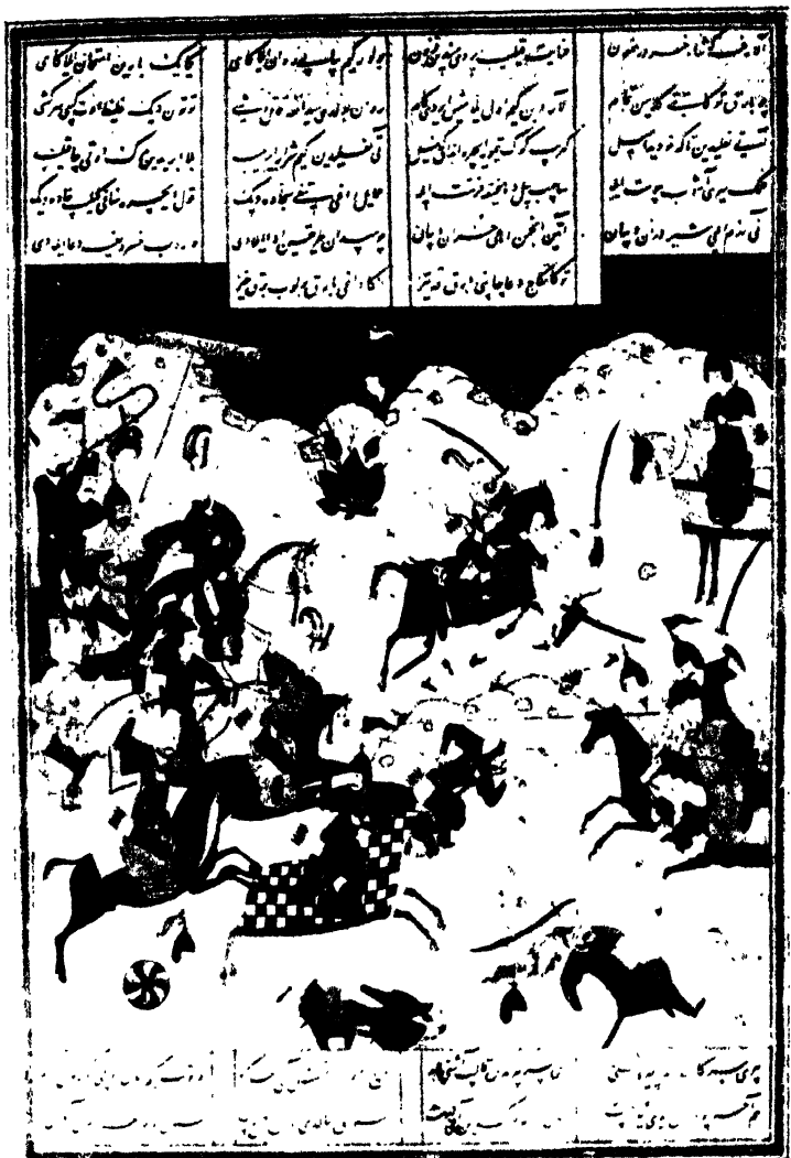
A BATTLE SCENE, PROBABLY OF ABOUT 1700

(The illustration is from the Shahnameh, the Persian epic.)