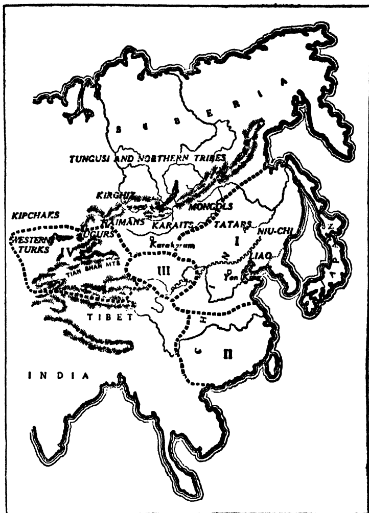
EASTERN ASIA, AT THE END OF THE TWELFTH CENTURY.

I. The Chin Empire; II. The Empire of the Lung; III. The Kingdom of Hia; IV. The Empire of Black Cathay.