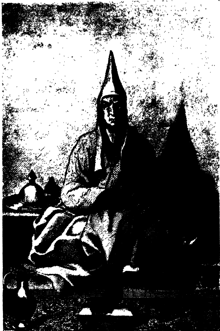
SHAMAN TIBTENGRI, THE MONGOL WIZARD. From an old French Work on Tartary.