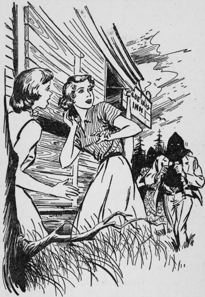
The girls were suddenly awakened to their danger