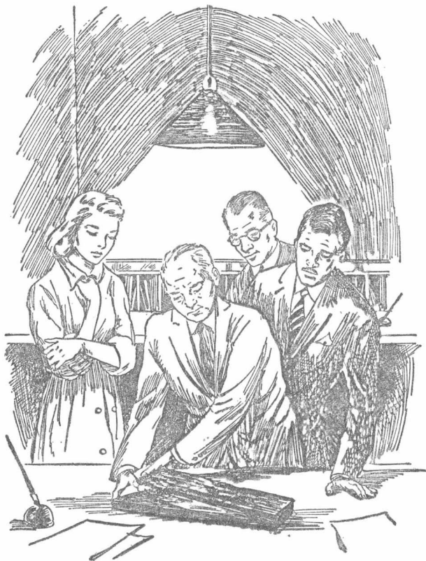
Nancy held her breath as Mr. Jensen opened the safe-deposit box