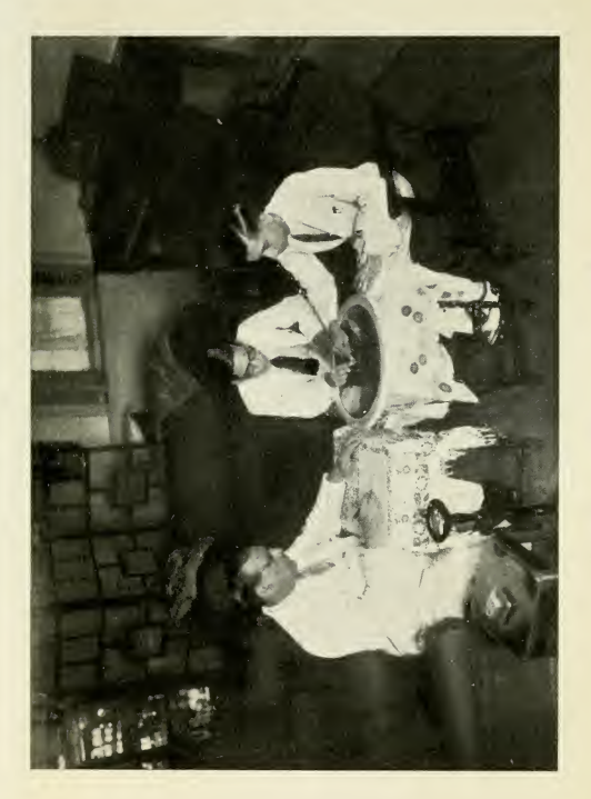
THE OUIJA BOARD: AT WORK.