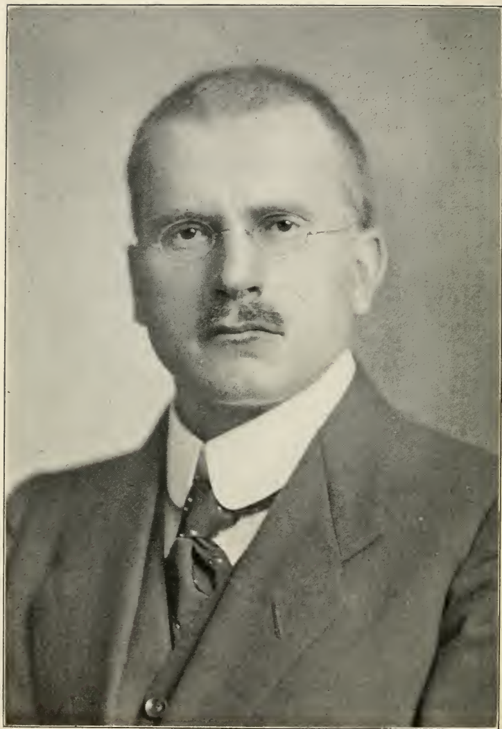
DR. C. G. JUNG "PSYCHOLOGY OF THE UNCONSCIOUS"