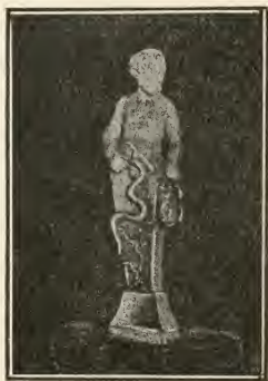
PRIAPUS AND SERPENT

This apparent contrast in the nature of the libido is strikingly illustrated by a Priapic statuette in the antique collection at Verona. 60 Priapus smilingly points with his finger to a snake biting off his "membrum." He carries