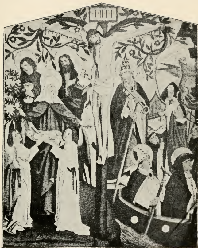
CHRIST ON THE TREE OF LIFE