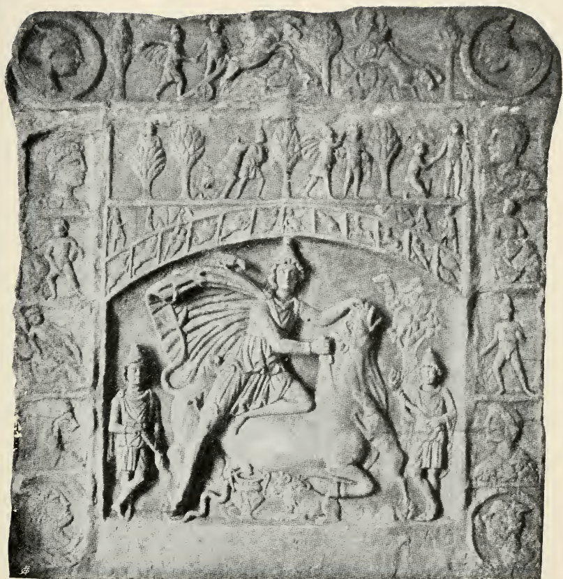
BULL-SACRIFICE OF MITHRA