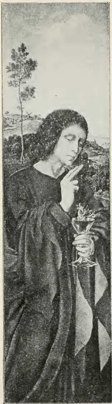
THE DRAGON IN THE GOBLET