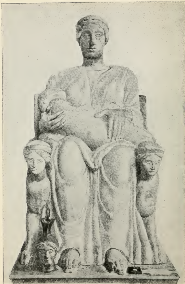
MATUTA, AN ETRUSCAN PIETÀ