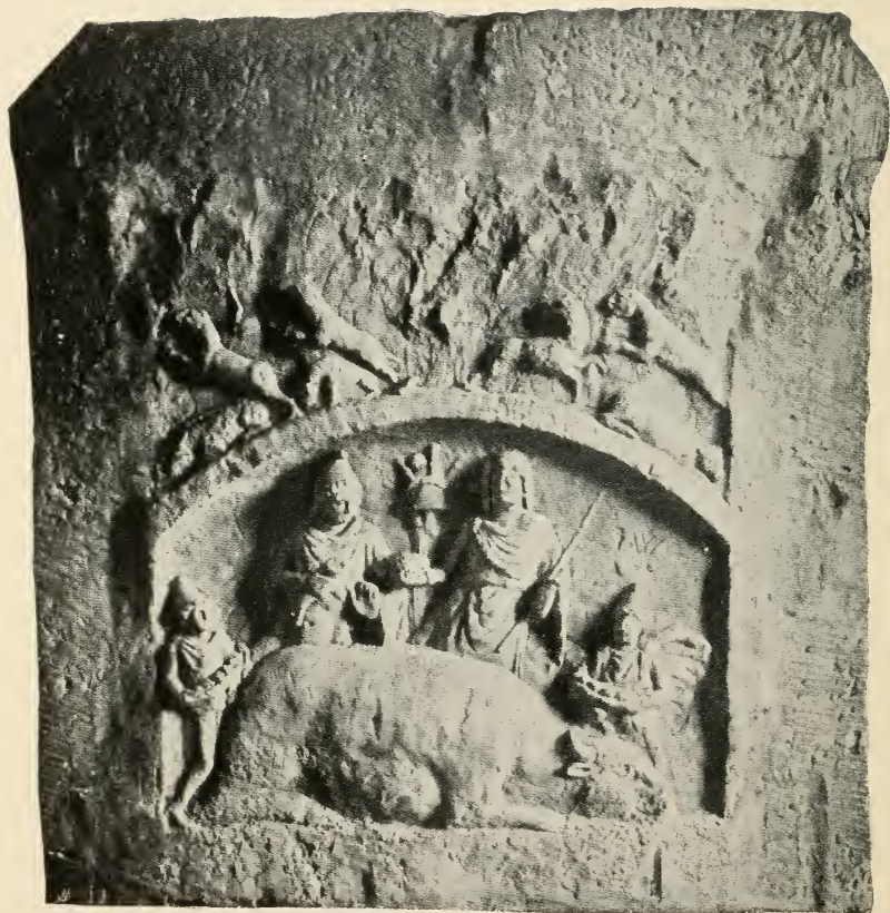
FRUCTIFICATION FOLLOWING UPON THE MITHRAIC SACRIFICE