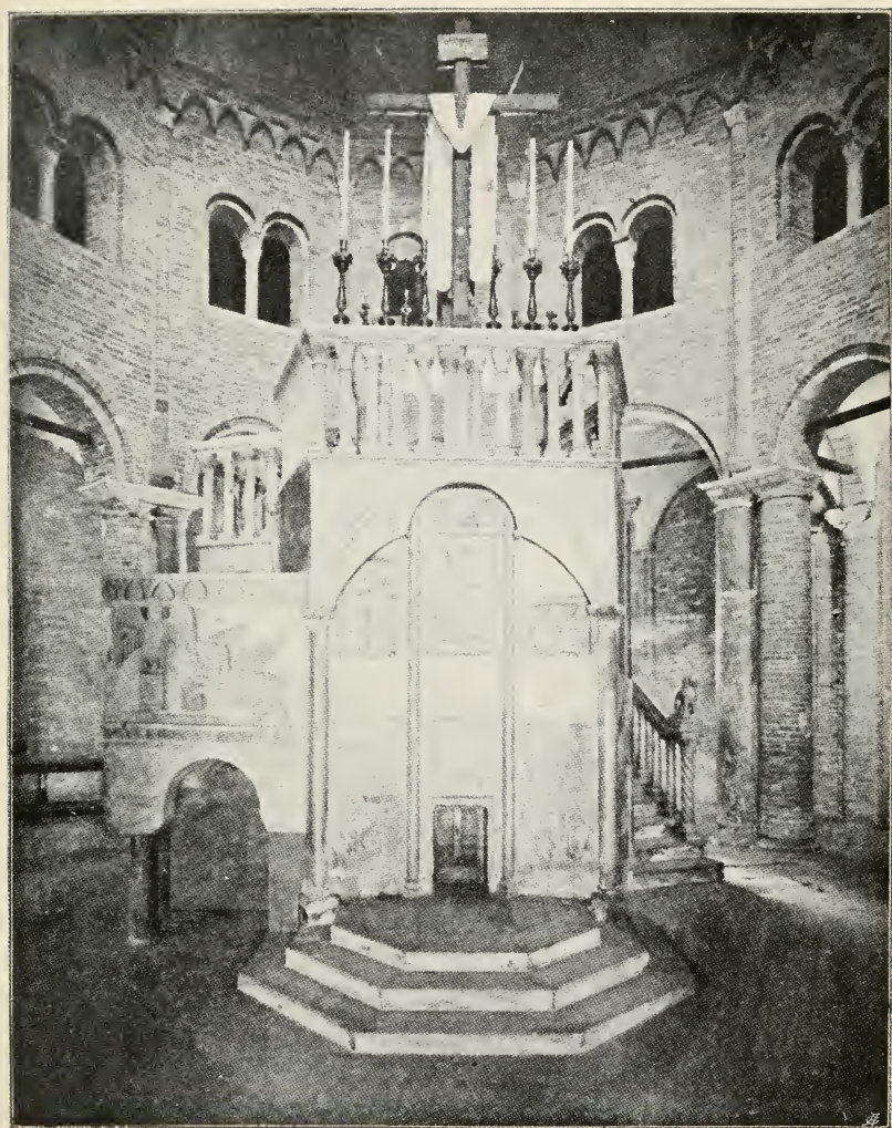
THE SO-CALLED HOLY SEPULCHRE OF S. STEFANO AT BOLOGNA