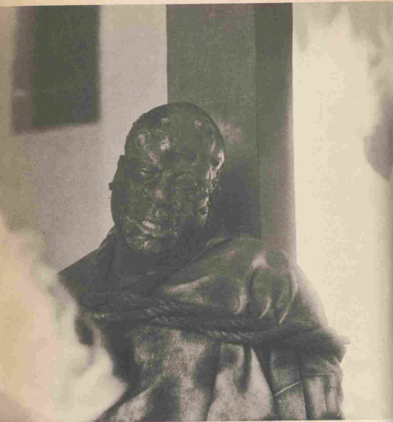
Father Grandier is burnt alive at the stake in Loudun's town square.