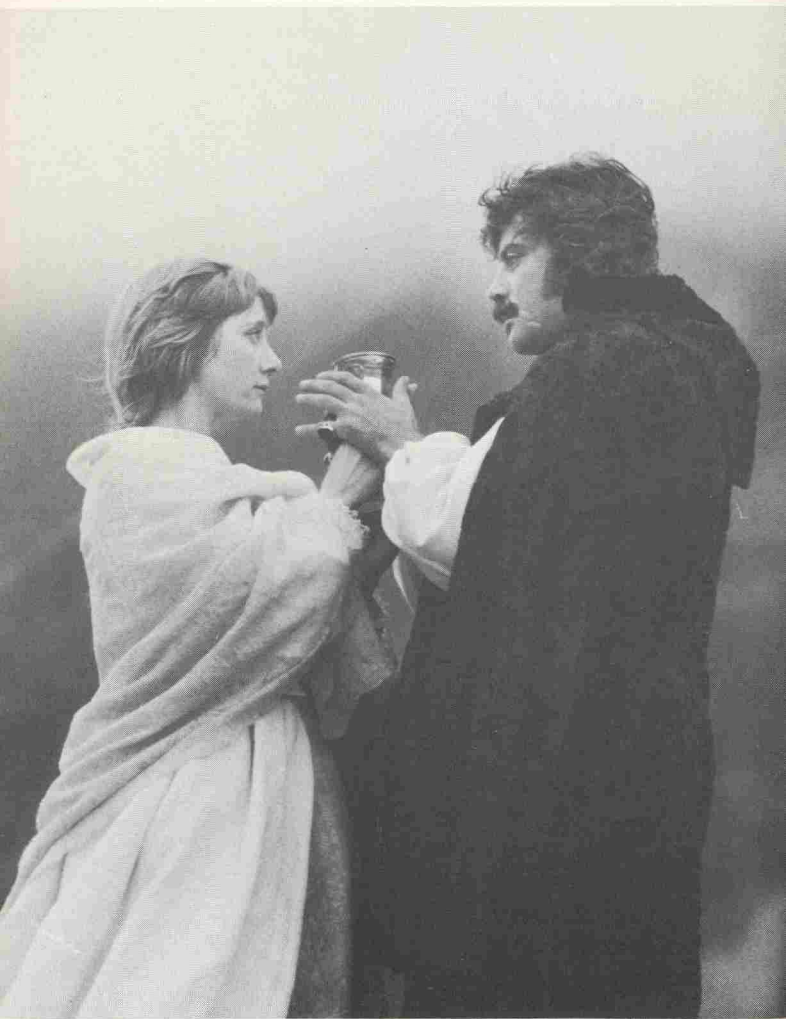
The transubstantiation sequence. Father Grandier and Sister Jeanne.