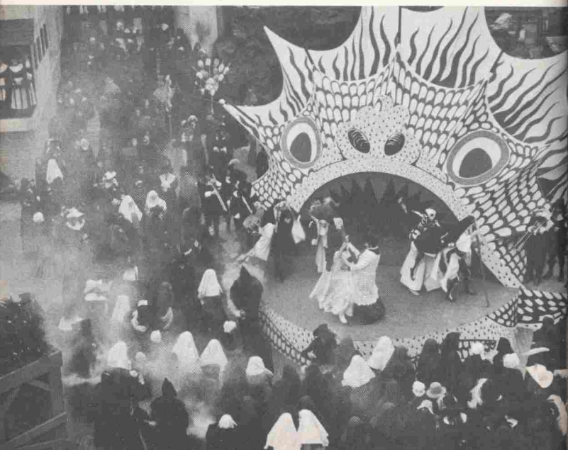
A huge crowd gathers in a carnival atmosphere in Loudun's town square to witness the burning at the stake of Father Grandier, unjustly accused of sorcery by a group of Ursuline nuns.