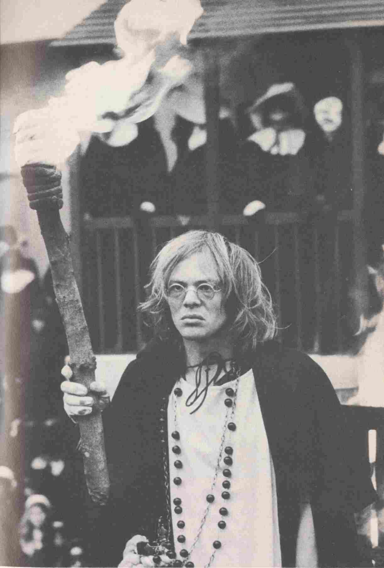
Father Barre prepares the torch which will burn Father Grandier at the stake.