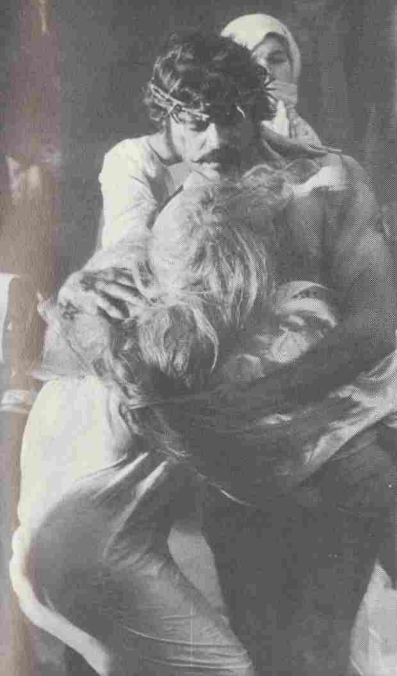
Sister Jeanne (Vanessa Redgrave) encounters Father Grandier (Oliver Reed) as Christ in her fantasy.