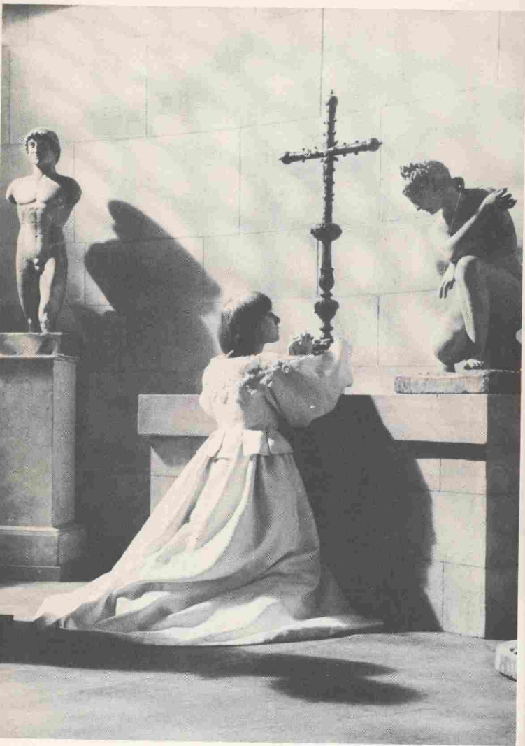
Madeleine (Gemma Jones) prays in Grandier's house.