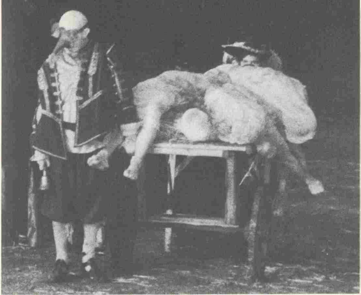
The death cart carries plague victims through the Loudun night.