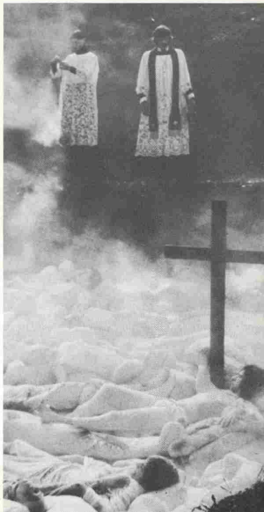
Father Grandier at the side of the plague burial pit.