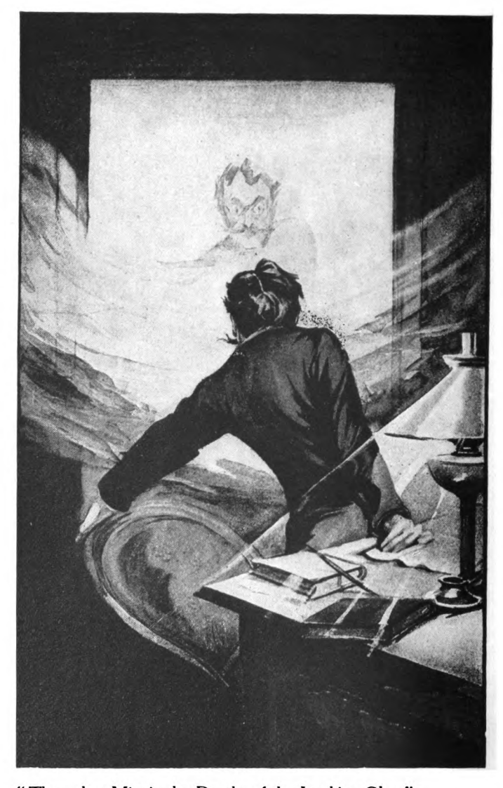
"Through a Mist in the Depths of the Looking-Glass" Drawing copyrighted, 1903, by M. Walter Dunne To illustrate "The Horla," by Guy de Maupassant