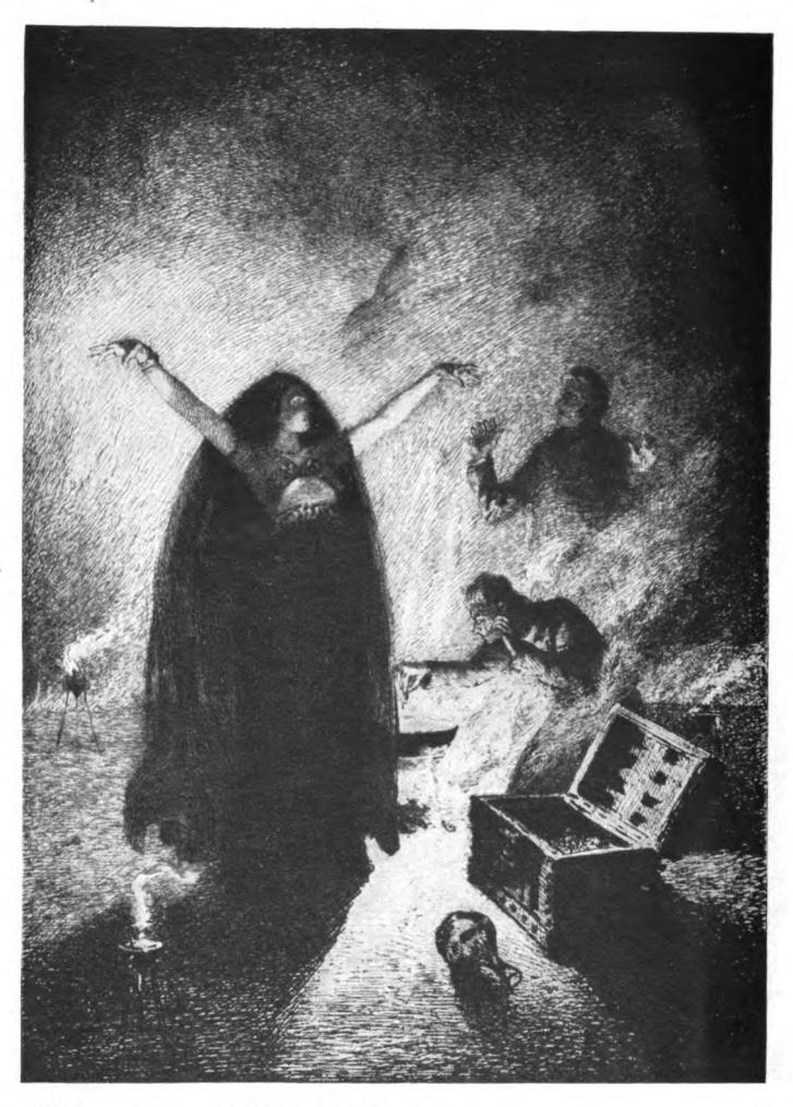
"Her Countenance Grew Fierce" To illustrate "The Incantation," by Bulwer-Lytton