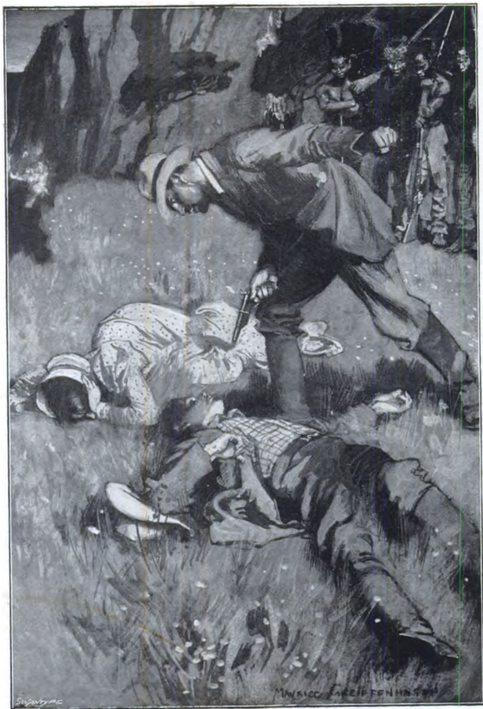
"THE DOG LIVES YET," BAVED SWART PIET.