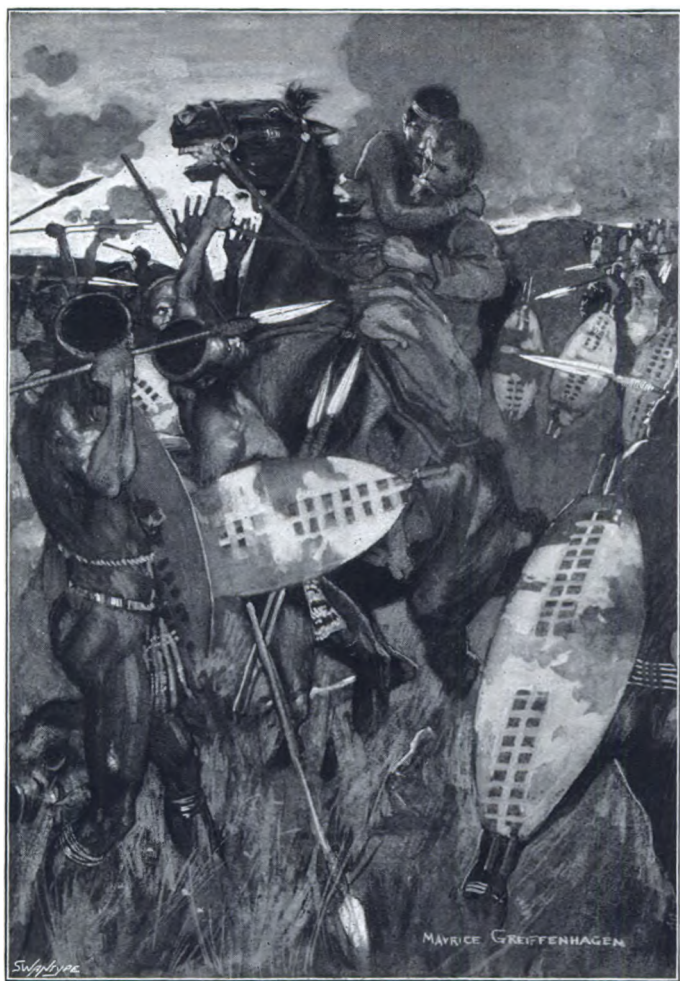
BLACK CLUTCHING HANDS CAUGHT FEET AND BRIDLE REIN.