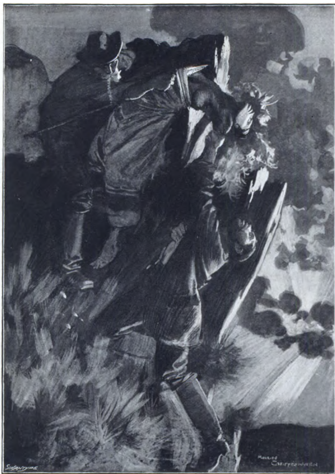
HE DREW THE SHARP EDGE OF THE SPEAR ACROSS THE LASHING.