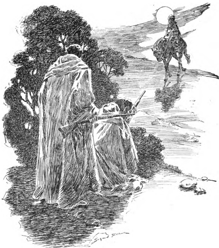
"A solitary figure seated on a very tired horse"