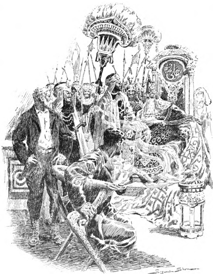
“Maqueda held her council in the great hall of the palace”