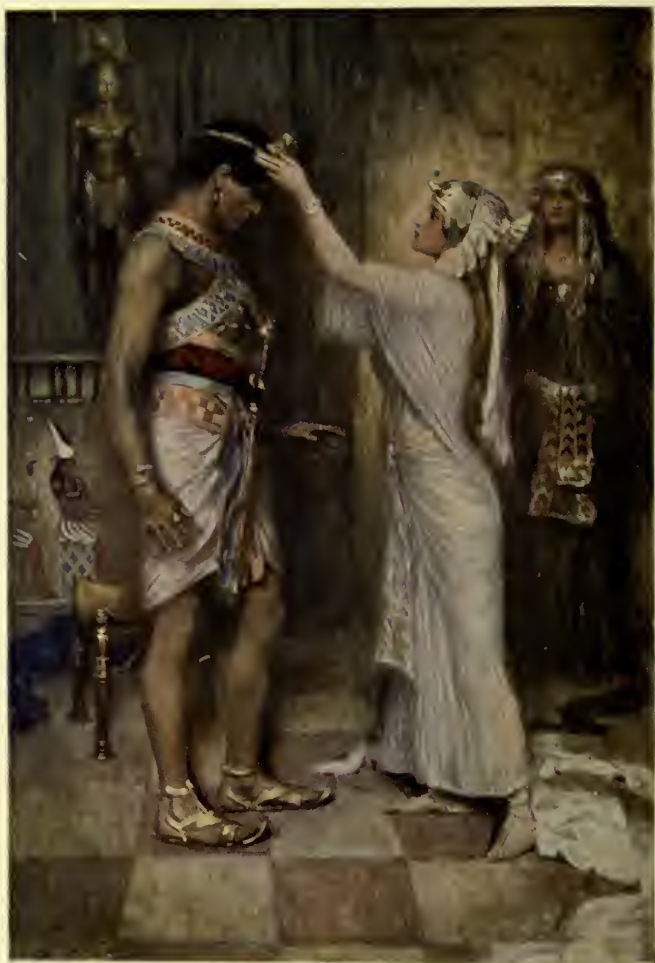
" And lifting the diadem of pearls crested with the royal urai , she set it on his brow " ( see page 285 ).