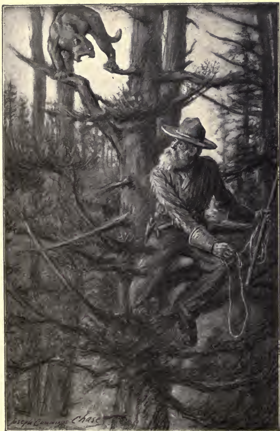
THE LION, SNARLING VICIOUSLY, STARTED TO DESCEND.