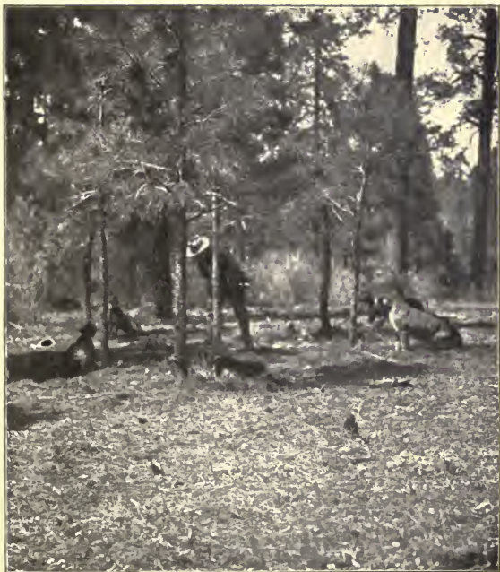
THE OLD HUNTER FEEDING THE CAPTIVE LIONS