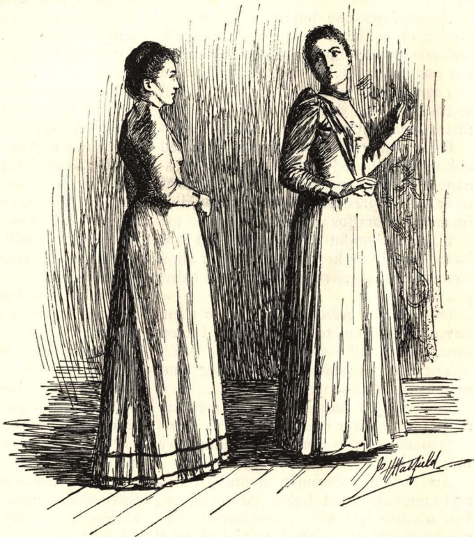
"She didn't know I was in the Room."