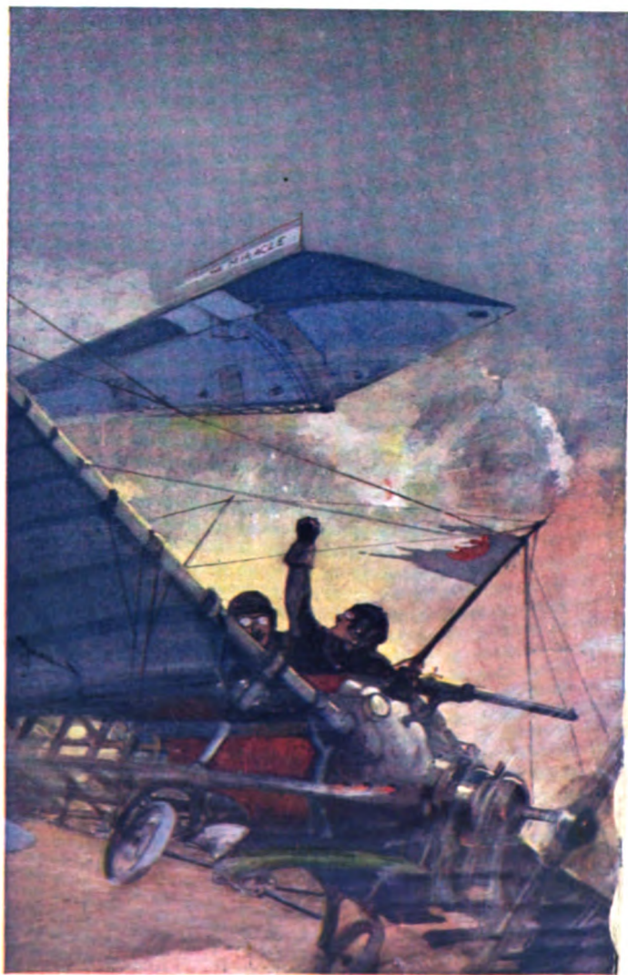
THE JAPANESE FLIERS WERE CIRCLING ABOVE THEIR ARMY'S ADVANCE