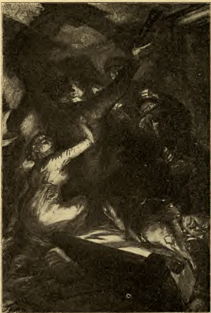
Aiming at the base of the skull she struck.