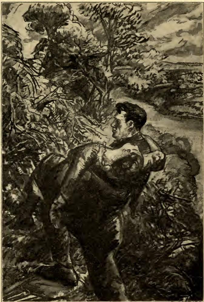
He gathered her up as though she had been a child.