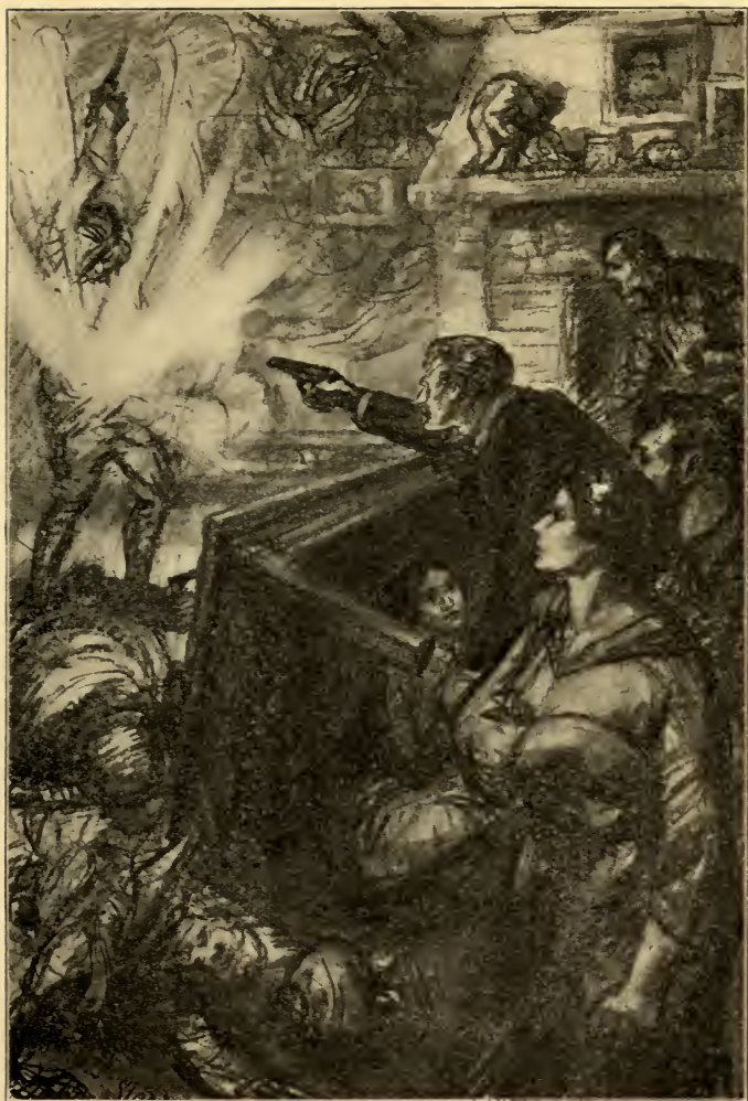
The spy's body burst into a sheaf of fire.