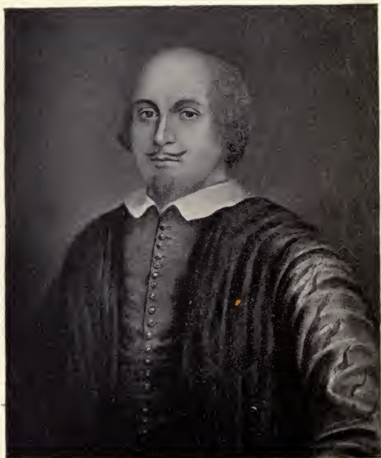
SHAKSPEARE. (The Stratford Portraitt.)