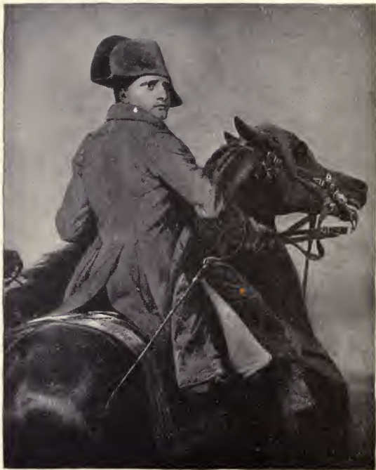
NAPOLEON AT JENA.

(From a painting by Horace Vernet in the Palace at Versailles.)