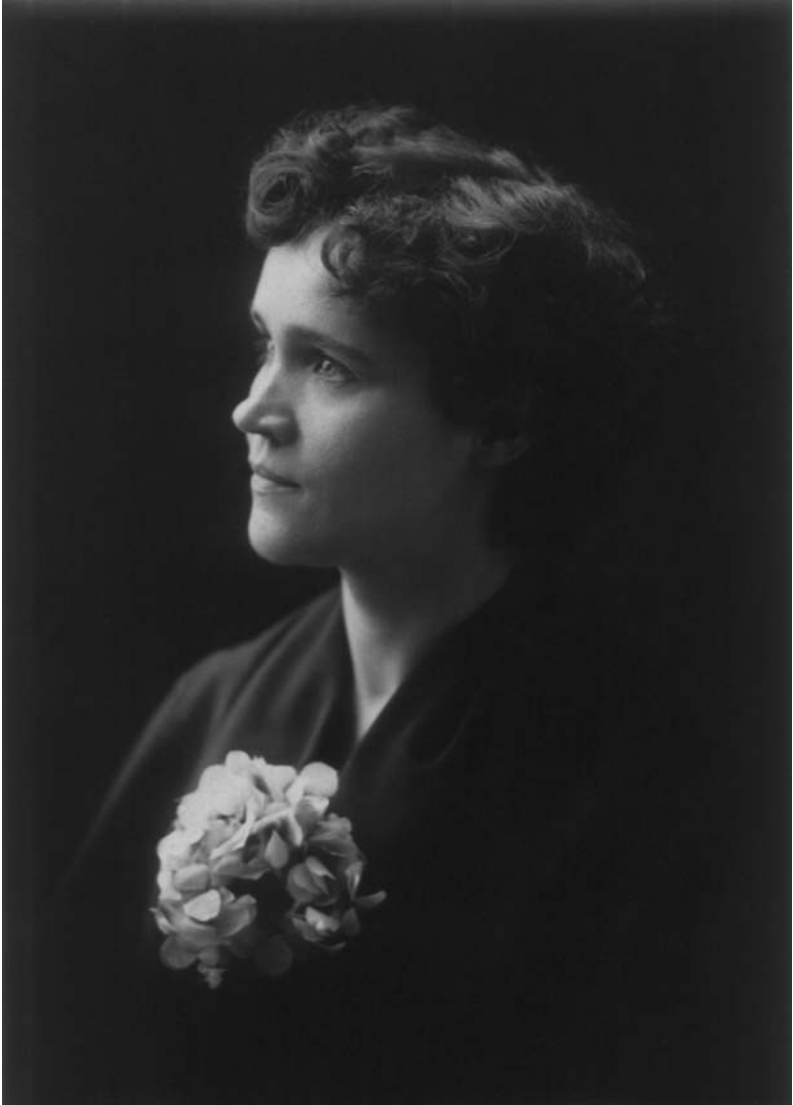
Voltairine de Cleyre, Philadelphia, 1901.