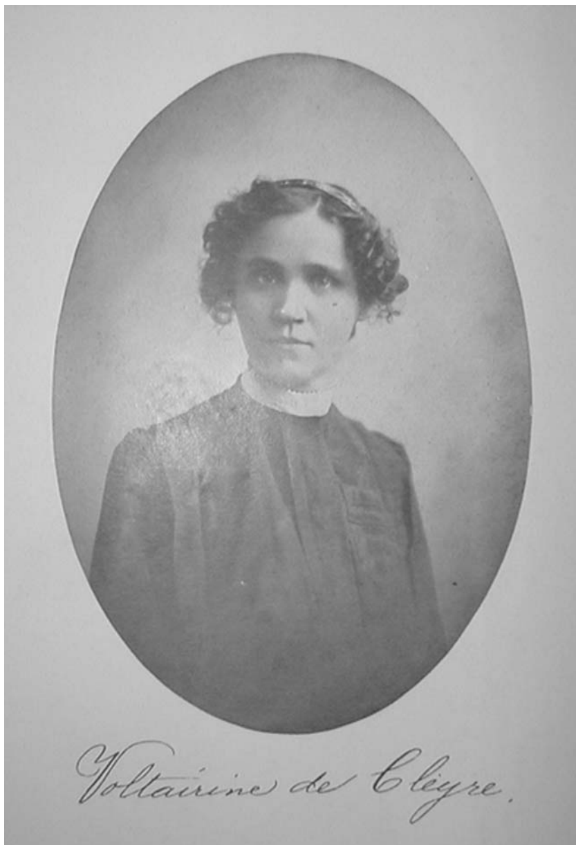
Voltairine de Cleyre, Chicago, 1910.