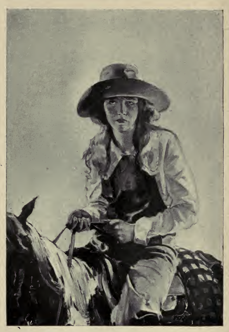
The girl drooped, tired from the long climb