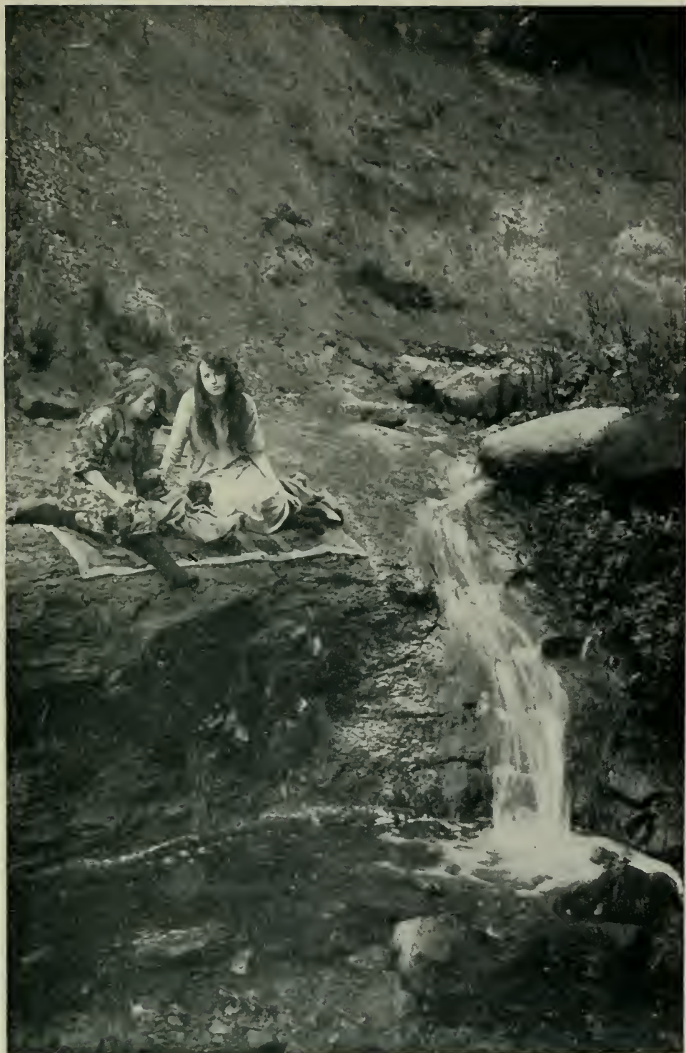
A VIEW OF THE BECK IN 1921