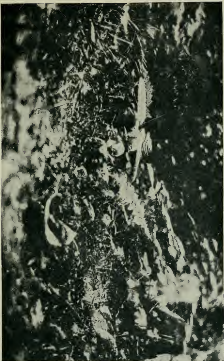
THE PHOTOGRAPH FROM CANADA