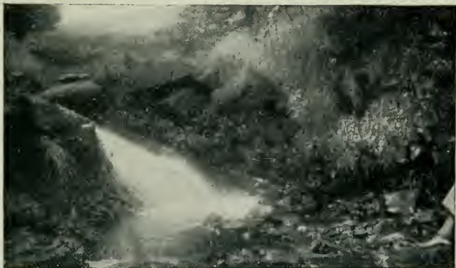
THE FALL OF WATER JUST ABOVE THE SITE OF LAST PHOTOGRAPH