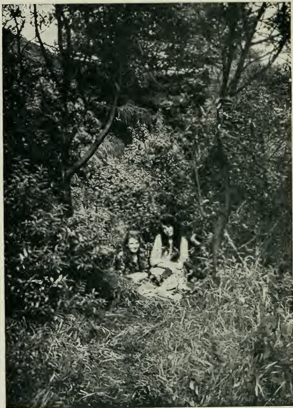
THE TWO GIRLS NEAR THE SPOT WHERE THE LEAPING FAIRY WAS TAKEN IN 1920