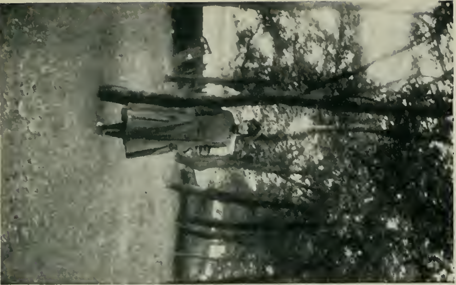
ELsie IN 1920, STANDING NEAR WHERE THE GNOME WAS TAKEN IN 1917