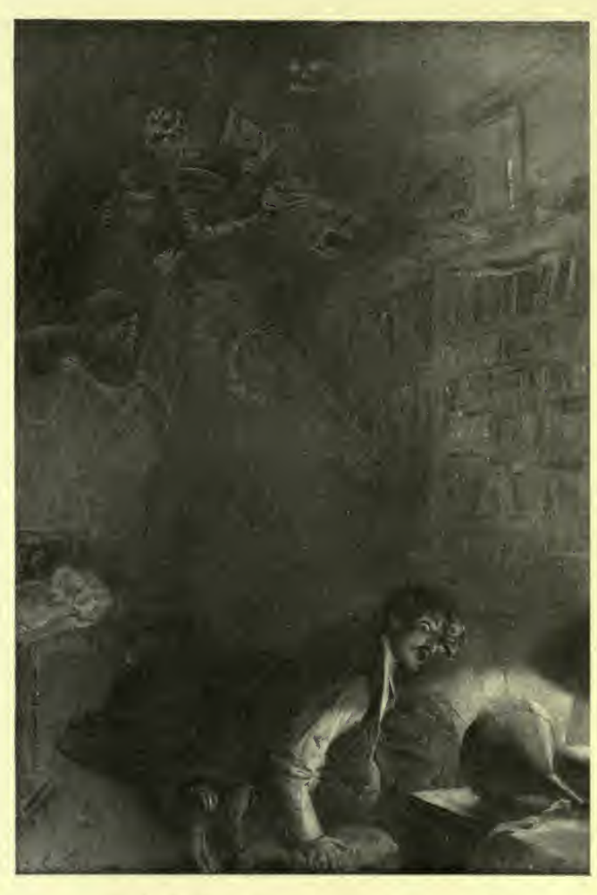
"I BURST WITH A SHRIEK INTO MY OWN LIFE."