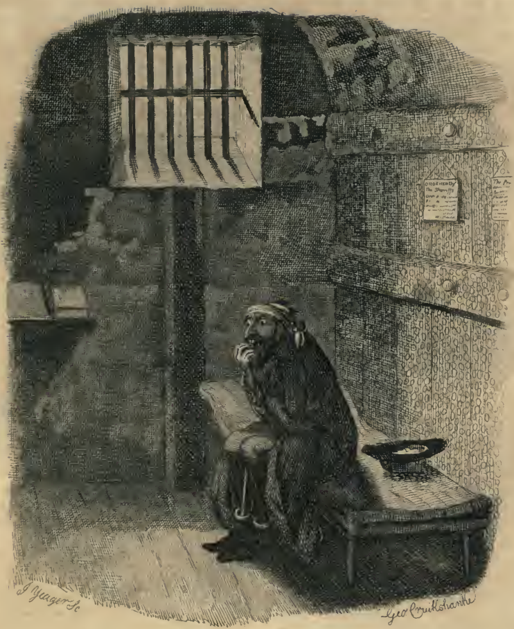
Fagin in the condemned Cell.