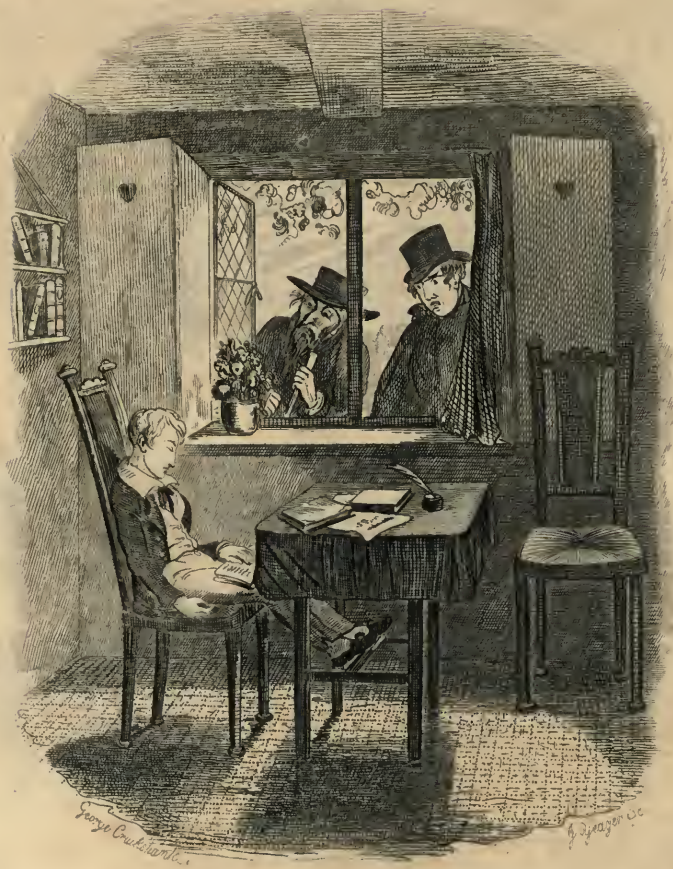
Winks and the Jew