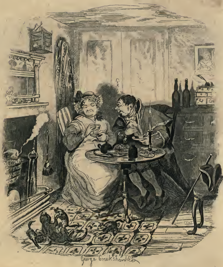
M r . Bumble and M rs . Cookey taking tea.