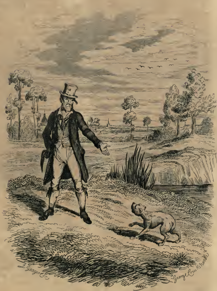
Man attempting to destroy his dog.