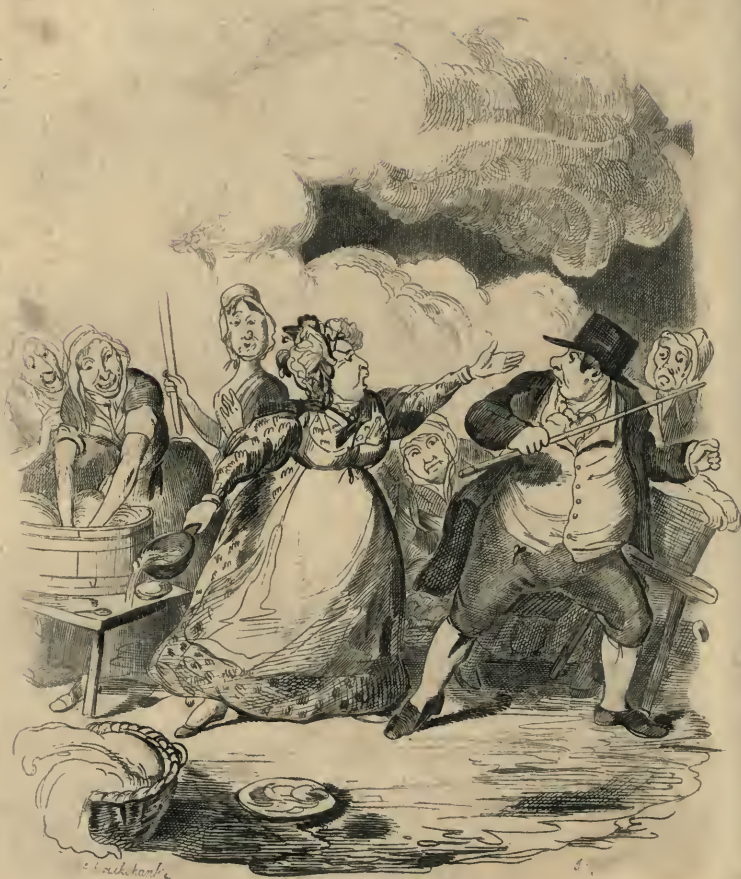
Mr. Pumble degraded in the eyes of the Paupers.