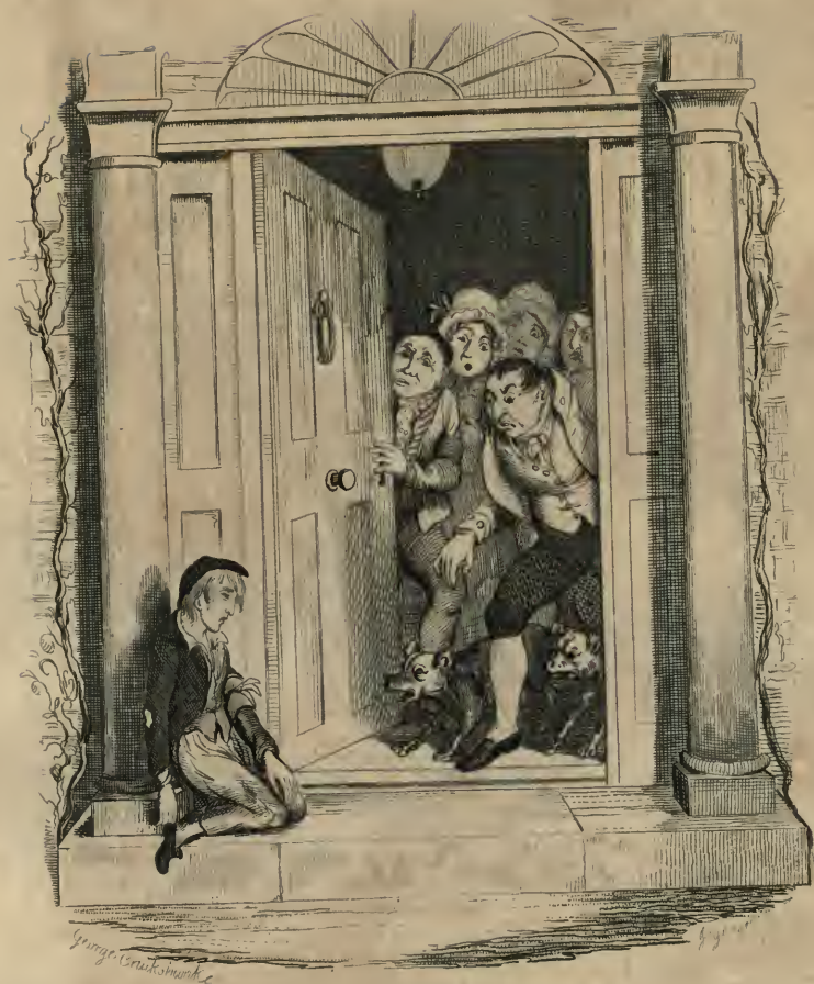
Oliver Twist at Mr. Maylies door.