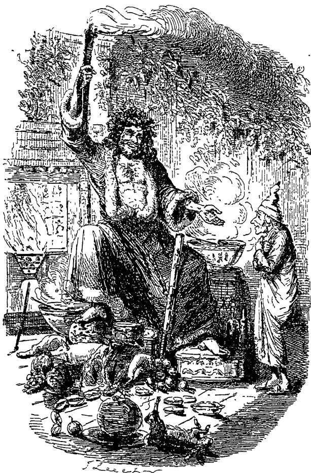
SCROOGE'S THIRD VISITOR.