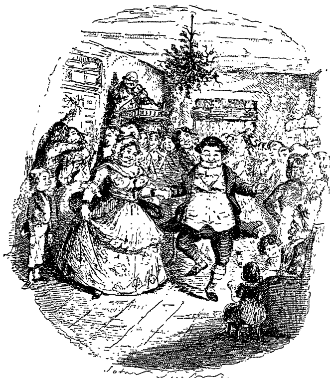
MR. FEZZIWIG'S BALL.