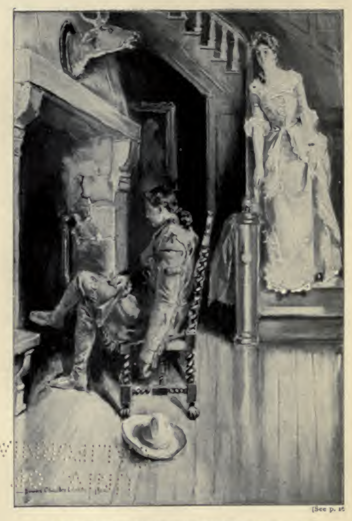
"I SAT DOWN HEAVILY IN HOMESICK SOLITUDE"