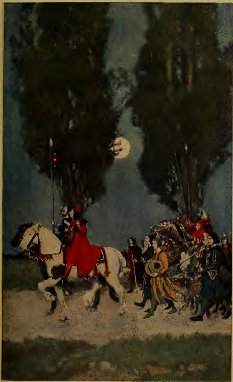
"The Bishop of Montors had returned"