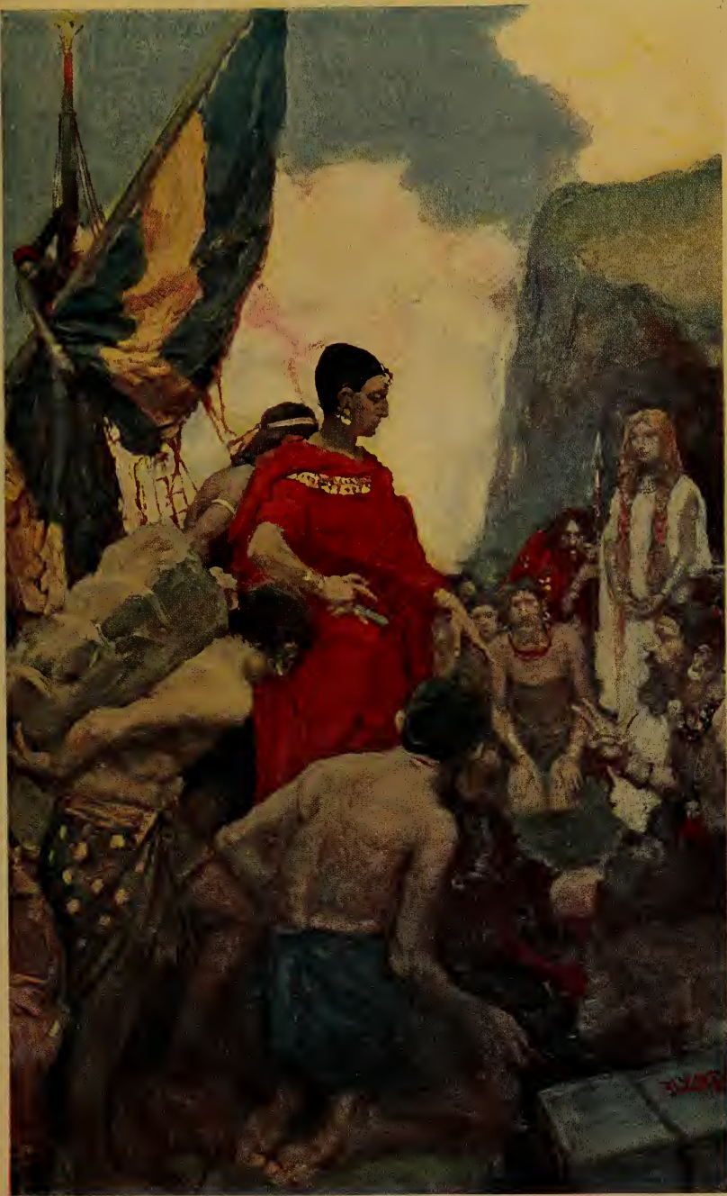
"Demetrios stood among them giving orders"