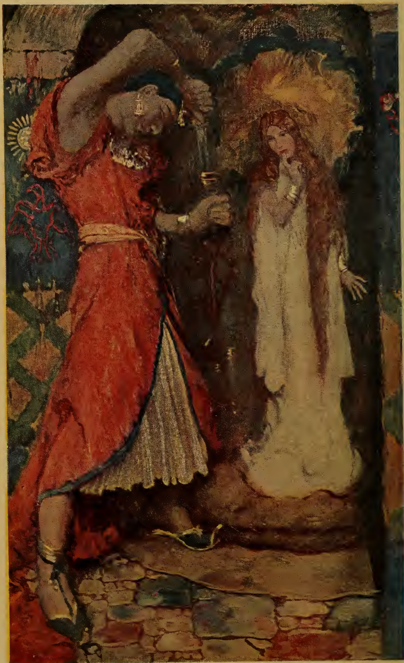
"Demetrios wrenched the sword from its scabbard"