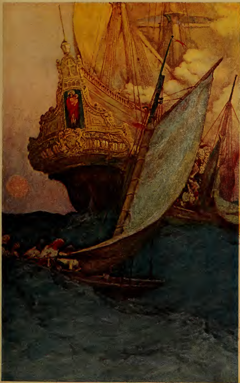
“Demetrios sent little boats”