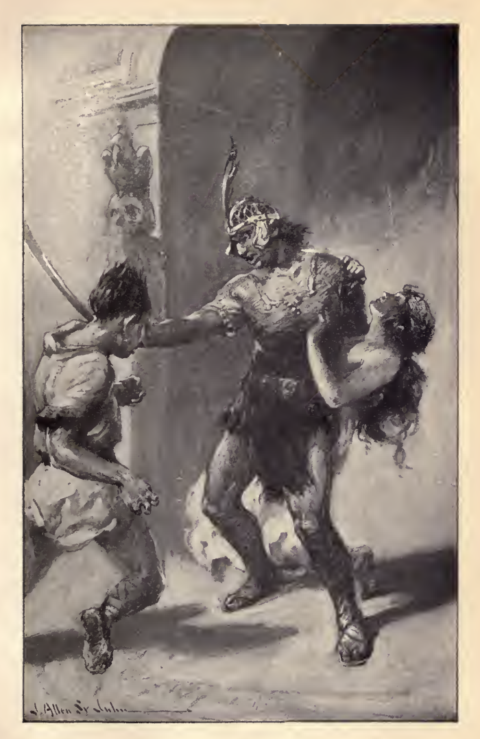
A fierce cut drove through the fellows collar bone. Page 348