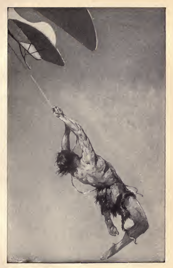
The ape-man swung pendulum-like in space. Page 234