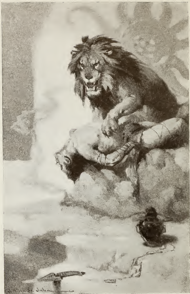
Standing above him was Jad-bal-ja, the Golden Lion