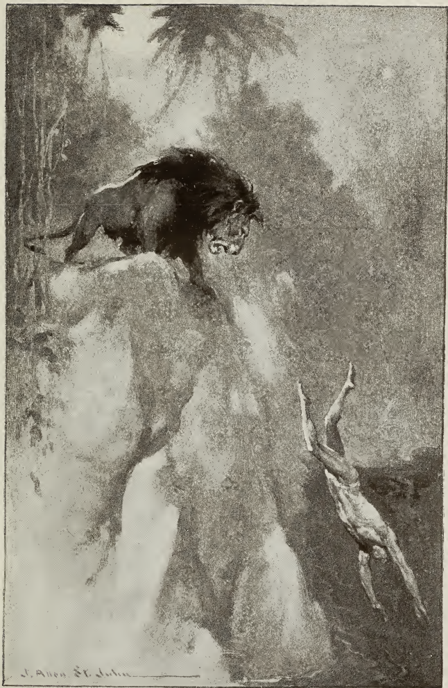
With a cry of terror the Spaniard dived into the river