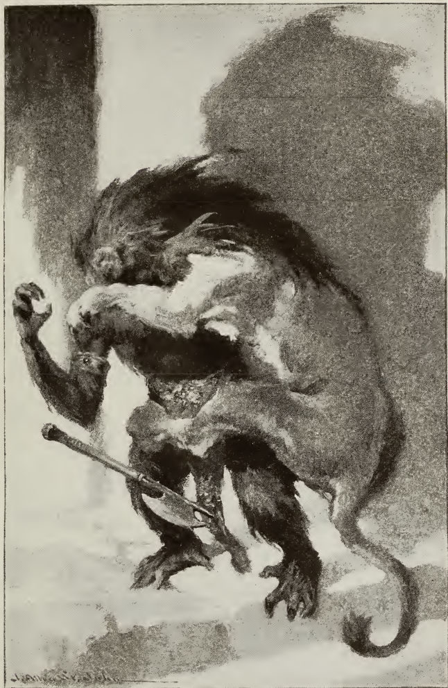
The Golden Lion with two mighty bounds was upon the High Priest