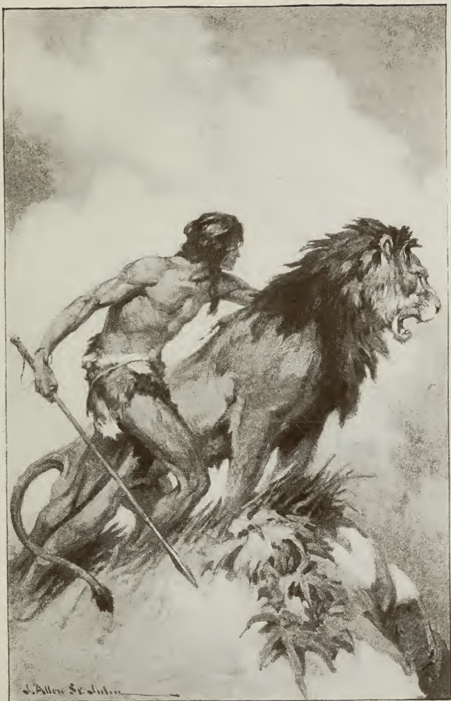
Hunting together, the man and the great lion trod the paths toward home