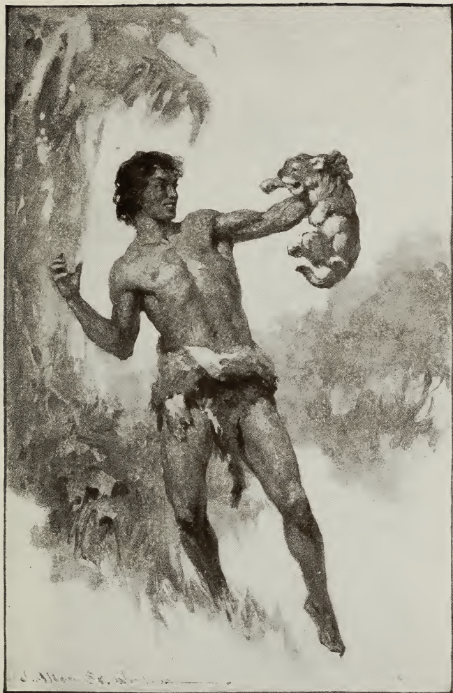
He caught the little lion by the scruff of its neck