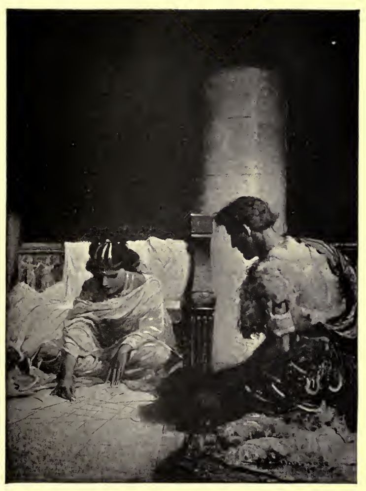
SHE DREW UPON THE MARBLE FLOOR THE FIRST MAP OF THE BARSOOMIAN TERRITORY I HAD EVER SEEN. Page 17