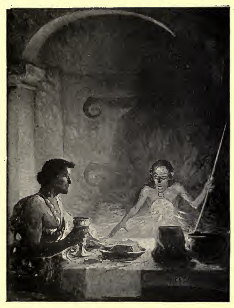
THE OLD MAN SAT AND TALKED WITH ME FOR HOURS. Page 224