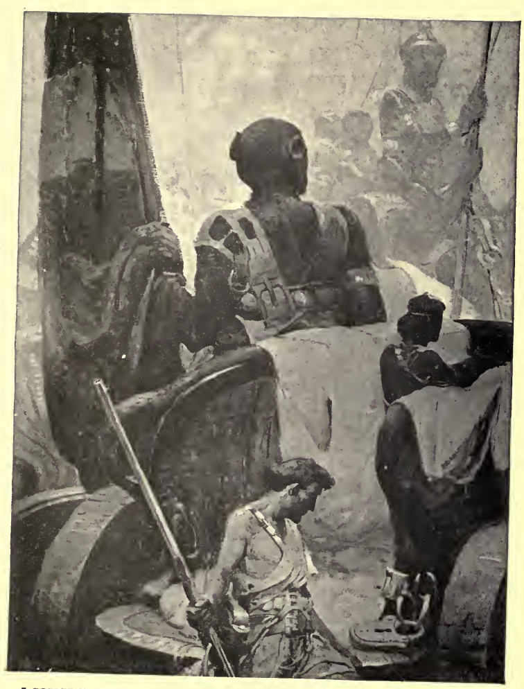
I SOUGHT OUT DEJAH THORIS IN THE THRONG OF DEPARTING CHARIOTS. Page 142