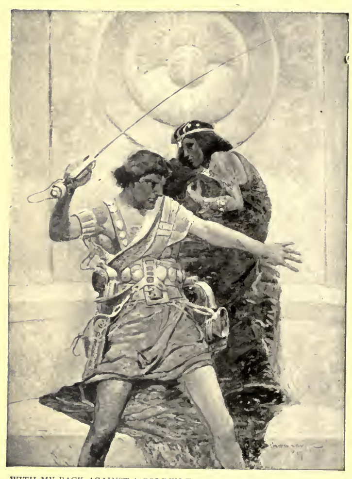
WITH MY BACK AGAINST A GOLDEN THRONE, I FOUGHT ONCE AGAIN FOR DEJAH THORIS.