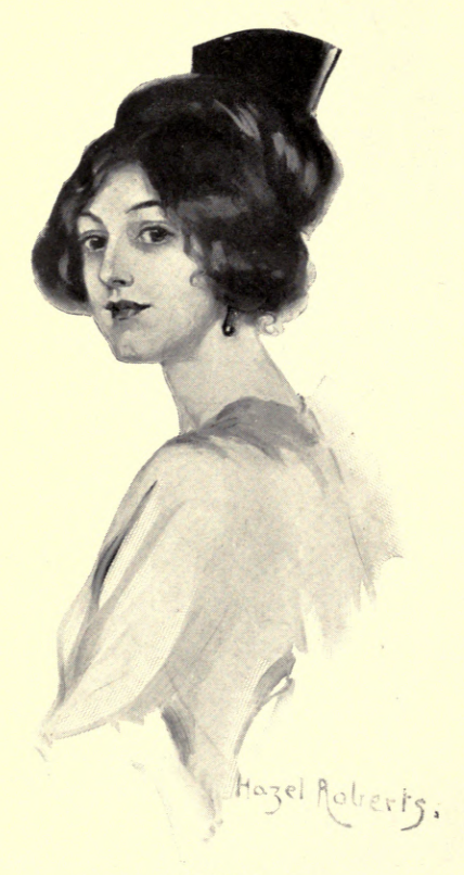
LESBA— DAUGHTER OF THE REVOLUTION.