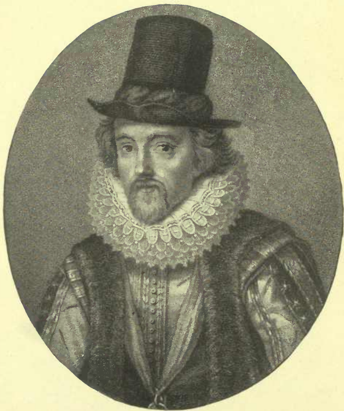
SIR FRANCIS BACON