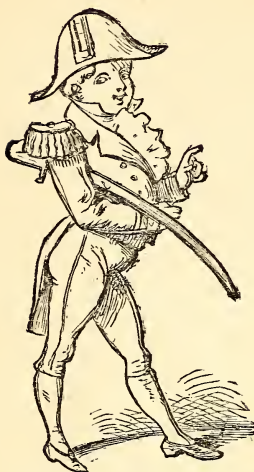
SIR JOSEPH PORTER, K.C.B.