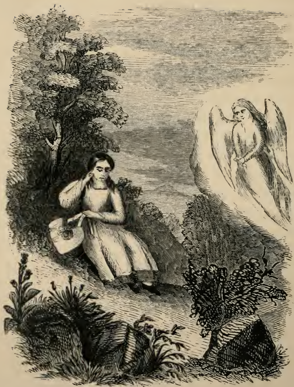
Anna finds no joy while a slave to evil passions.