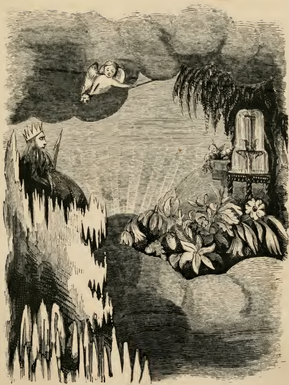
The Frost King's Palace.