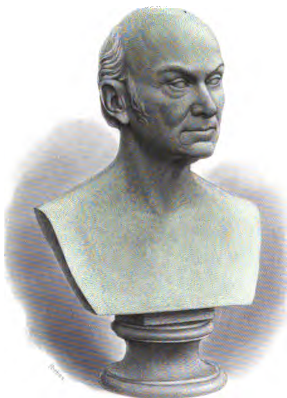
FROM A BUST BY H. POWERS.