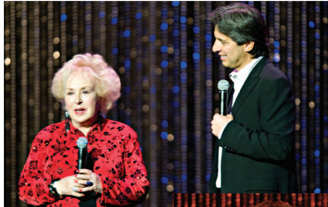
Host Ray Romano; Doris Roberts; Susie Essman