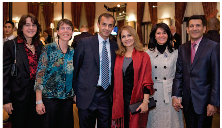
The team from Sapphire Sponsor Binding Site