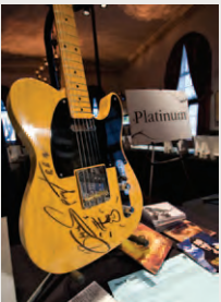
The IMF's 4th Annual Comedy Celebration featured some of comedy's biggest names before a sold-out crowd. The star-studded line up had the guests rolling in the aisles in hilarity.