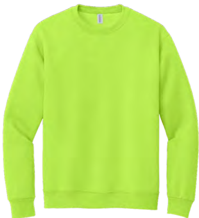
JERZEES® Super Sweats® NuBlend® Crewneck Sweatshirt 4662M | Adult Sizes: S-3XL