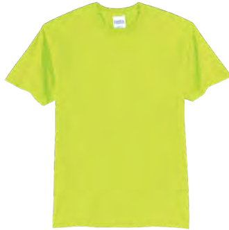
PORT & COMPANY® Core Blend Tee PC55 | PC55T | PC55Y | Adult Sizes: S-6XL | Tall Sizes: LT-4XLT | Youth Sizes: XS-XL