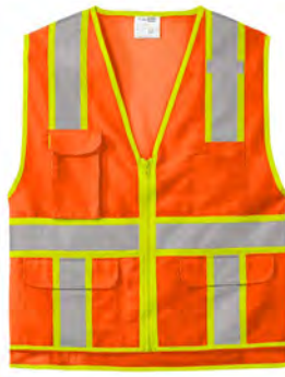
CORNERSTONE® ANSI 107 Class 2 Surveyor Zippered Two-Tone Vest CSV105 | Adult Sizes: S/M, L/XL, 2XL/3XL, 4XL/5XL