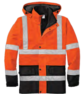
CORNERSTONE® ANSI 107 Class 3 Waterproof Parka CSJ24 | Adult Sizes: S-4XL