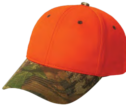
PORT AUTHORITY® Enhanced Visibility Cap with Camo Brim C804