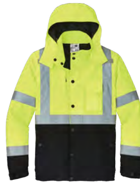
CORNERSTONE® ANSI 107 Class 3 Waterproof Insulated Ripstop Bomber Jacket CSJ501 | Adult Sizes: S-5XL