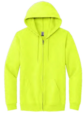
GILDAN® Heavy Blend™ Full-Zip Hooded Sweatshirt 18600 | Adult Sizes: S-5XL