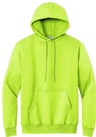
PORT & COMPANY® Essential Fleece Pullover Hooded Sweatshirts PC90H | PC90HT | Adult Sizes: S-4XL Tall Sizes: LT-4XLT