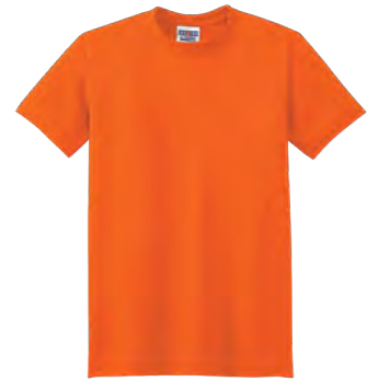
JERZEES® Dri-Power® 100% Polyester T-Shirt 21M | Adult Sizes: S-3XL