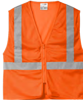
CORNERSTONE® ANSI 107 Class 2 Economy Mesh Zippered Vest CSV101 | Adult Sizes: S/M, L/XL, 2XL/3XL, 4XL/5XL