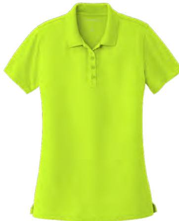
PORT AUTHORITY® Ladies Dry Zone® UV Micro-Mesh Polo LK110 | Adult Sizes: XS-4XL