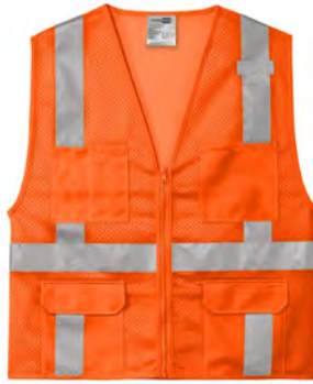
CORNERSTONE® ANSI 107 Class 2 Mesh Six- Pocket Zippered Vest CSV104 | Adult Sizes: S/M, L/XL, 2XL/3XL, 4XL/5XL