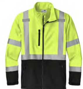
CORNERSTONE® ANSI 107 Class 3 Soft Shell Jacket CSJ503 | Adult Sizes: S-5XL