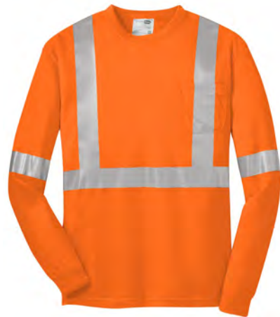
CORNERSTONE® ANSI 107 Class 2 Long Sleeve Safety T-Shirt CS401LS | Adult Sizes: XS-4XL