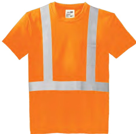
CORNERSTONE® ANSI 107 Class 2 Safety T-Shirt CS401 | Adult Sizes: XS-4XL