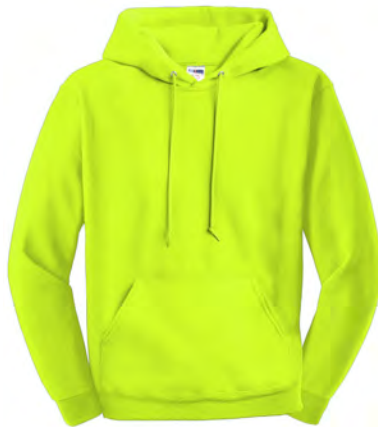
JERZEES® Super Sweats® NuBlend® Pullover Hooded Sweatshirt 4997M | Adult Sizes: S-3XL