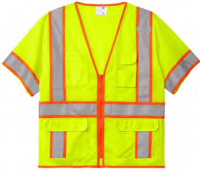
CORNERSTONE® ANSI 107 Class 3 Surveyor Mesh Zippered Two-Tone Short Sleeve Vest CSV106 | Adult Sizes: M-5XL