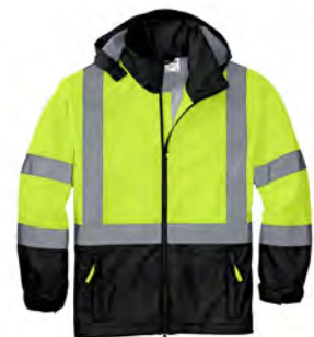
CORNERSTONE® ANSI 107 Class 3 Safety Windbreaker CSJ25 | Adult Sizes: S-4XL