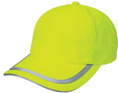
PORT AUTHORITY® Enhanced Visibility Cap C836