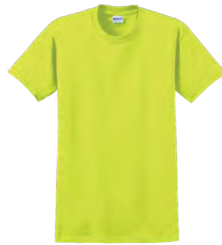
GILDAN® Ultra Cotton® 100% US Cotton T-Shirts 2000 | 2000T | 2000B | Adult Sizes: S-5XL | Tall Sizes: LT-3XLT | Youth Sizes: XS-XL