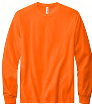
VOLUNTEER KNITWEAR™ All-American Long Sleeve Tee VL100LS | Adult Sizes: S-4XL