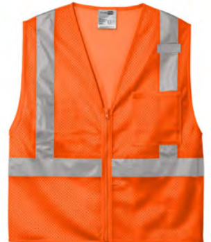
CORNERSTONE® ANSI 107 Class 2 Mesh Zippered Vest CSV102 | Adult Sizes: S/M, L/XL, 2XL/3XL, 4XL/5XL