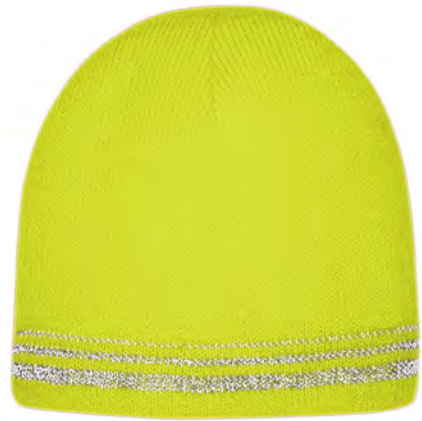
CORNERSTONE® Lined Enhanced Visibility with Reflective Stripes Beanie CS804