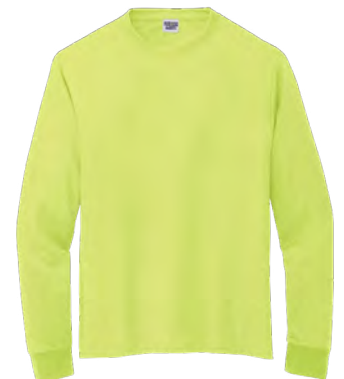
JERZEES® Dri-Power® 100% Polyester Long Sleeve T-Shirt 21LS | Adult Sizes: S-3XL