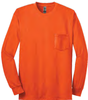
GILDAN® Ultra Cotton® 100% US Cotton Long Sleeve T-Shirt with Pocket 2410 | Adult Sizes: S-5XL