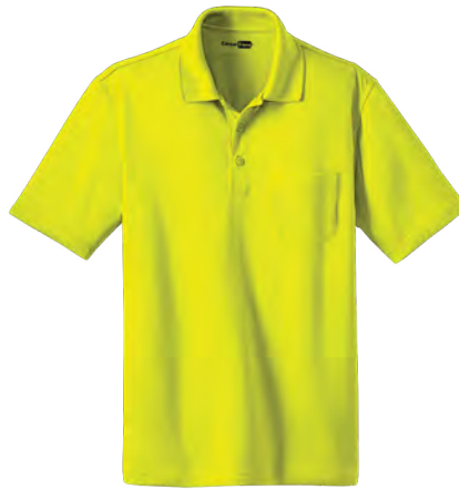
CORNERSTONE® Select Snag-Proof Pocket Polo CS412P | Adult Sizes: XS-4XL