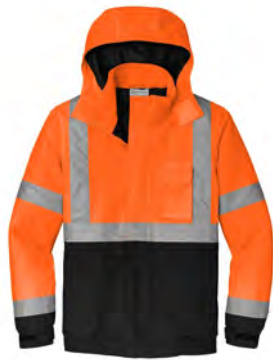
CORNERSTONE® ANSI 107 Class 3 Economy Waterproof Insulated Bomber Jacket CSJ500 | Adult Sizes: S-5XL