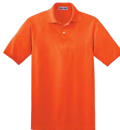
JERZEES® SpotShield™ 5.4-Ounce Jersey Knit Sport Shirt 437M | Adult Sizes: S-4XL