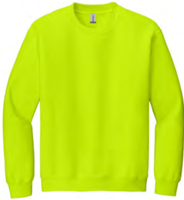
GILDAN® Heavy Blend™ Crewneck Sweatshirt 18000 | Adult Sizes: S-5XL