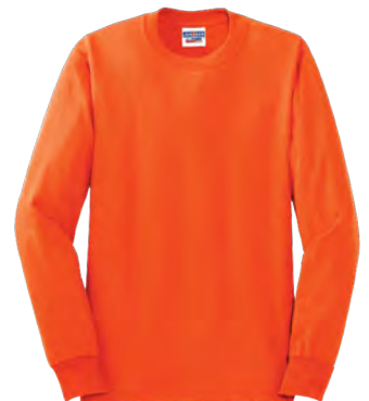
JERZEES® Dri-Power® 50/50 Cotton/ Poly Long Sleeve T-Shirt 29LS | Adult Sizes: S-3XL