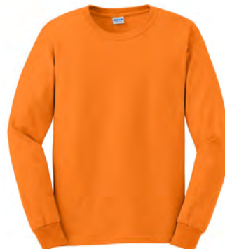
GILDAN® Ultra Cotton® 100% US Cotton Long Sleeve T-Shirt G2400 | Adult Sizes: S-5XL