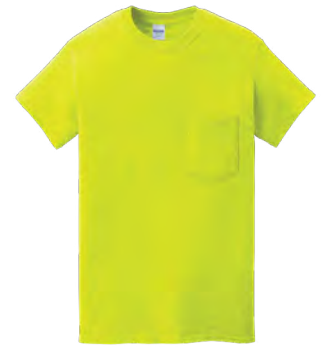
GILDAN® Heavy Cotton™ 100% Cotton Pocket T-Shirt 5300 | Adult Sizes: S-3XL