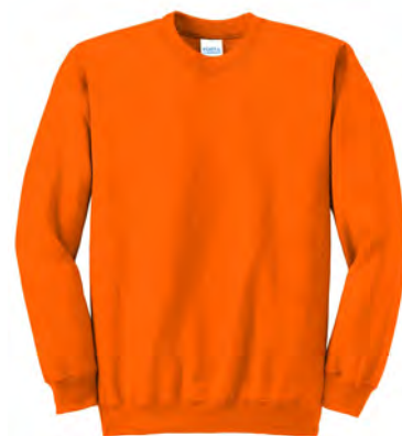
PORT & COMPANY® Essential Fleece Crewneck Sweatshirts PC90 | PC90T | Adult Sizes: S-4XL Tall Sizes: LT-4XLT