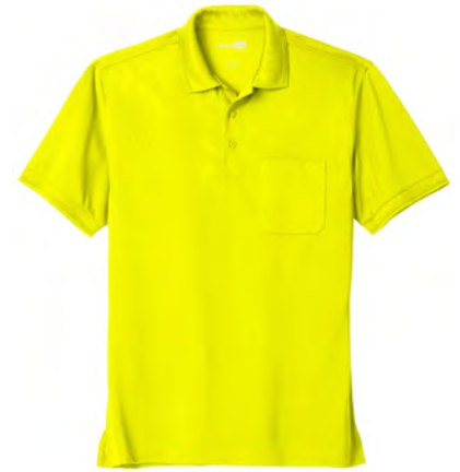
CORNERSTONE® Industrial Snag-Proof Pique Pocket Polo CS4020P | Adult Sizes: XS-6XL