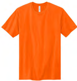
HANES® Cool Dri® Performance T-Shirt 4820 | Adult Sizes: XS-3XL