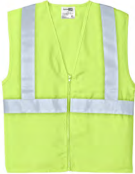
CORNERSTONE® ANSI 107 Class 2 Safety Vest CSV400 | Adult Sizes: S/M, L/ XL, 2XL/3XL