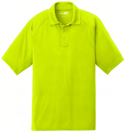
CORNERSTONE® Select Lightweight Snag-Proof Tactical Polo CS420 | Adult Sizes: XS-4XL