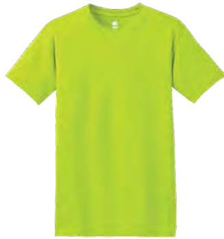
HANES® Essential-T 100% Cotton T-Shirt 5280 | Adult Sizes: S-3XL