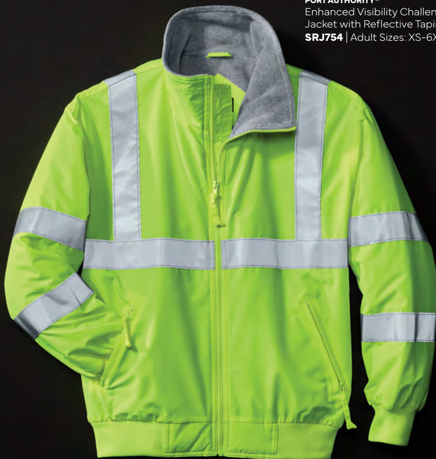
PORT AUTHORITY® Enhanced Visibility Challenger™ Jacket with Reflective Taping SRJ754 | Adult Sizes: XS-6XL