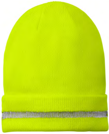
CORNERSTONE® Enhanced Visibility Beanie with Reflective Stripe CS800