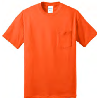
PORT & COMPANY® Core Blend Pocket Tees PC55P | PC55PT Adult Sizes: S-6XL | Tall Sizes LT-4XLT