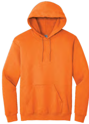
GILDAN® Heavy Blend™ Hooded Sweatshirt 18500 | Adult Sizes: S-5XL