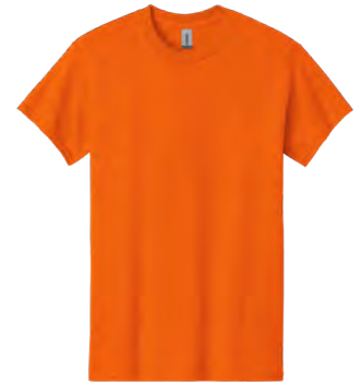
GILDAN® Heavy Cotton™ 100% Cotton T-Shirt 5000 | 5000B | Adult Sizes: S-3XL | Youth Sizes: XS-XL