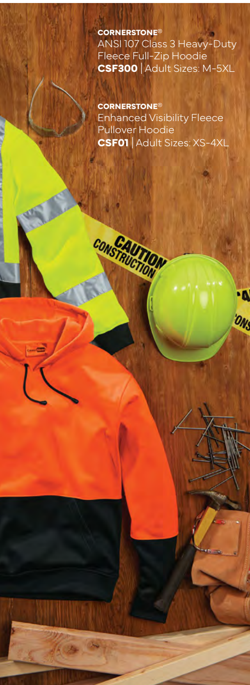
CORNERSTONE® ANSI 107 Class 3 Heavy-Duty Fleece Full-Zip Hoodie CSF300 | Adult Sizes: M-5XL