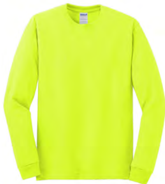
GILDAN® Heavy Cotton™ 100% Cotton Long Sleeve T-Shirt 5400 | Adult Sizes: S-3XL