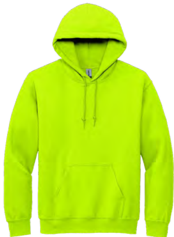
GILDAN® DryBlend® Pullover Hooded Sweatshirt 12500 | Adult Sizes: S-3XL