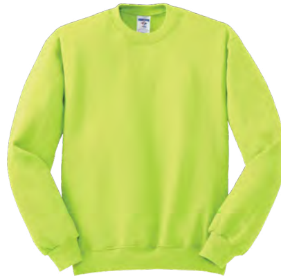
JERZEES® NuBlend® Crewneck Sweatshirt 562M | Adult Sizes: S-4XL