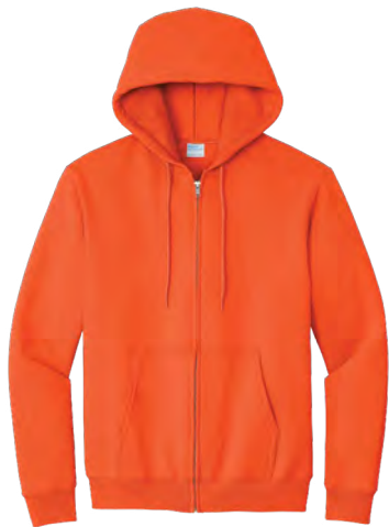
PORT & COMPANY® Essential Fleece Full-Zip Hooded Sweatshirts PC90ZH | PC90ZHT | Adult Sizes: S-4XL Tall Sizes: LT-4XLT