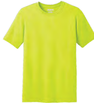
GILDAN Performance® T-Shirt 42000 | Adult Sizes: S-3XL