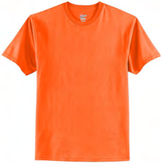
HANES® Authentic 100% Cotton T-Shirt 5250 | Adult Sizes: S-5XL