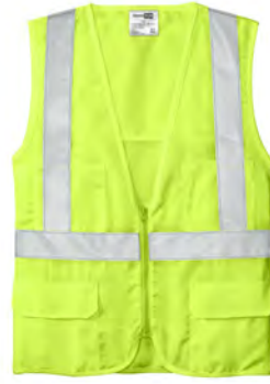
CORNERSTONE® ANSI 107 Class 2 Mesh Back Safety Vest CSV405 | Adult Sizes: S-4XL