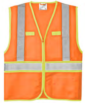
CORNERSTONE® ANSI 107 Class 2 Dual-Color Safety Vest CSV407 | Adult Sizes: S-4XL