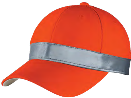
CORNERSTONE® ANSI 107 Safety Cap CS802