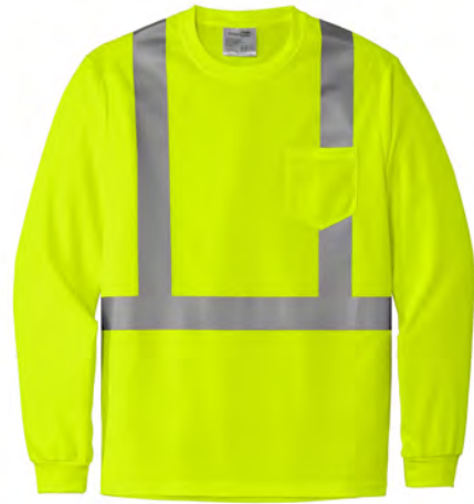
CORNERSTONE® ANSI 107 Class 2 Mesh Long Sleeve Tee CS201 | Adult Sizes: S-5XL