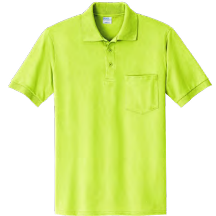
PORT & COMPANY® Core Blend Jersey Knit Polos KP55 | KP55T | Adult Sizes: XS-6XL Tall Sizes: LT-4XLT