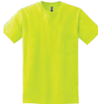
GILDAN® Ultra Cotton® 100% US Cotton T-Shirt with Pocket 2300 | Adult Sizes: S-5XL