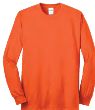
PORT & COMPANY® Long Sleeve Core Blend Tees PC55LS | PC55LST | Adult Sizes: S-6XL | Tall Sizes: LT-4XLT