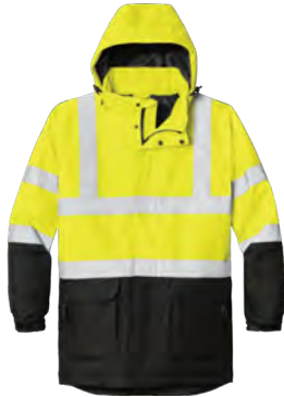
PORT AUTHORITY ANSI 107 Class 3 Safety Heavyweight Parka J799S | Adult Sizes: XS-4XL