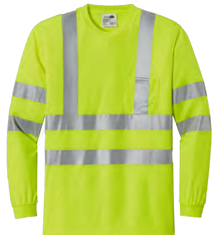
CORNERSTONE® ANSI 107 Class 3 Long Sleeve Snag-Resistant Reflective T-Shirt CS409 | Adult Sizes: XS-4XL