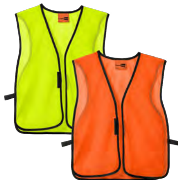
CORNERSTONE® Enhanced Visibility Mesh Vest CSV01 | One Size Fits Most