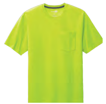
CORNERSTONE® Workwear Pocket Tee CS430 | Adult Sizes: S-4XL