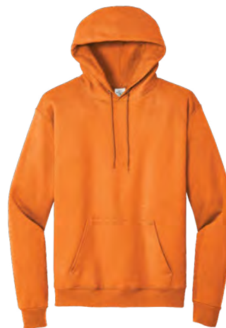
HANES® EcoSmart® Pullover Hooded Sweatshirt P170 | Adult Sizes: S-5XL