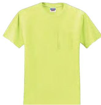
JERZEES® Dri-Power® 50/50 Cotton/ Poly T-Shirts 29M | 29B | Adult Sizes: S-5XL | Youth Sizes: XS-XL