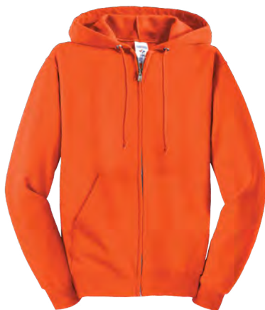
JERZEES® NuBlend® Full-Zip Hooded Sweatshirt 993M | Adult Sizes: S-3XL