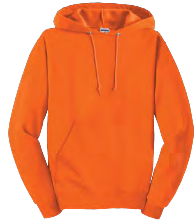
JERZEES® NuBlend® Pullover Hooded Sweatshirt 996M | Adult Sizes: S-4XL