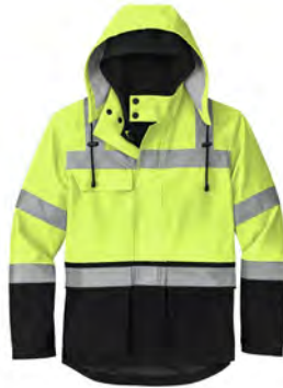
CORNERSTONE® ANSI 107 Class 3 Waterproof Ripstop 3-in-1 Parka CSJ502 | Adult Sizes: S-5XL