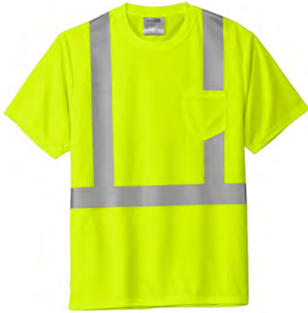
CORNERSTONE® ANSI 107 Class 2 Mesh Tee CS200 | Adult Sizes: S-5XL