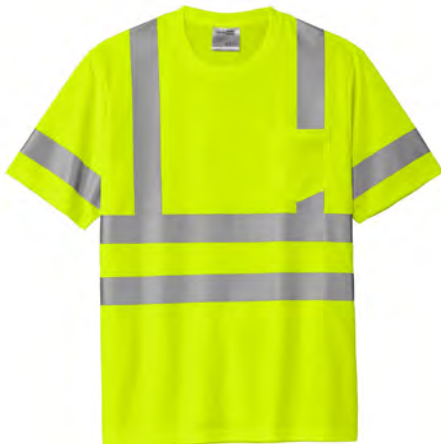
CORNERSTONE® ANSI 107 Class 3 Mesh Tee CS202 | Adult Sizes: M-5XL