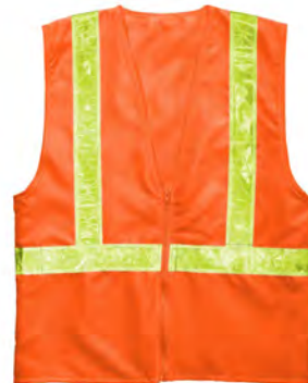
PORT AUTHORITY Enhanced Visibility Vest SV01 | Adult Sizes: S/M, L/XL, 2XL/3XL