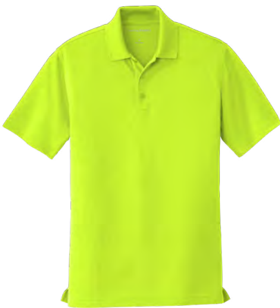
PORT AUTHORITY® Dry Zone® UV Micro-Mesh Polo KT10 | Adult Sizes: XS-6XL