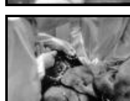
Photo was taken at angle, side view, looking at body from 45° elevation, left hand was visible, head was facing to left, body was right to left position (head on right, feet on left), eyes were closed appeared oriental-looking and almond shaped, left hand slight longer than normal, wrist coming down just about 2 to 3 inches above the knees. Wrists appeared to be articulated in a fashion that allowed a double joint with 3 digit fingers. Wrist was very slender. There was no thumb. A palm was almost non-existent. The three fingers were direct extension from the wrist.

Color of the skin was bluish gray, dark bluish gray. At base of the body there was a darker color, indicating body was dead for some time. Body fluid or blood had settled to base of body. This indicated that body had been examined before beginning autopsy.