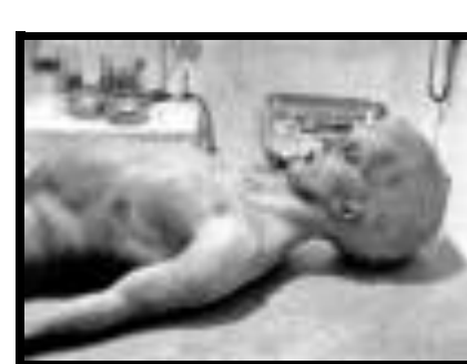
Photo number 1 showed an alien being on an autopsy table which is a metal table with runnels and traps underneath to trap fluid and feces. Body appeared to be a little short of 4 feet. Table was about 7 foot. No clothing on body, no genitalia, body completely heterous, head was rounded cranium, slightly enlarged, eyes almond shaped, slits where nose would be, extremely small mouth, receding chin line, holes where ears would be.

About midway through the report came a section which dealt specifically with photographs. Each photo was labeled and appended to certain reports. A number of photos in there dealt with a recovery program of some type that took place in the southwestern part of the United States. They did not give a location name but they did give grid coordinates for that area. There is no clear indication to exactly where it was. The photos dealt with special teams that were called in to recover a crashed UFO. It also dealt with alien bodies and autopsy reports, autopsy type photographs, high quality, color, 8x10, 5x7.